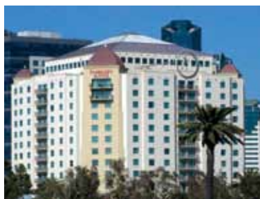
Embassy Suites San Diego by the Bay

The Cliffs Resort is perched atop bluffs overlooking some of the world's most pristine beaches. Enjoy this hotel - inspired by, and in harmony with, its breathtaking ocean setting. Relax your mind and indulge your senses in this Mediterranean climate, drenched in sunshine. Our award-winning resort will dazzle you with its exquisite and alluring setting.