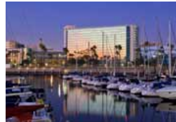
Hyatt Regency Hotel

The Hyatt Regency, located at the edge of beautiful Rainbow Harbor, features water views from all guest rooms, is close to shops and restaurants, plus beautiful sunsets!