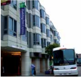
Holiday Inn Express Fisherman's Wharf

With shops, restaurants and a diverse array of attractions, you'll find yourself surrounded by the sights and sounds of this exciting area, the Holiday Inn Express Fisherman's Wharf hotel is a perfect starting point for exploring San Francisco's most distinctive neighborhood.