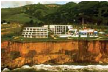
The Cliffs at Shell Beach (Coastal View Rooms)

The Hotel Pacific in Monterey is a unique, all-suite boutique hotel, conveniently located blocks from Fisherman's Wharf.