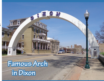
Famous Arch in Dixon