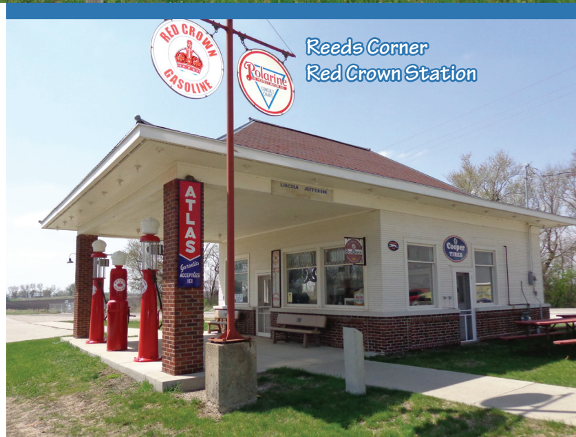
Reeds Corner Red Crown Station