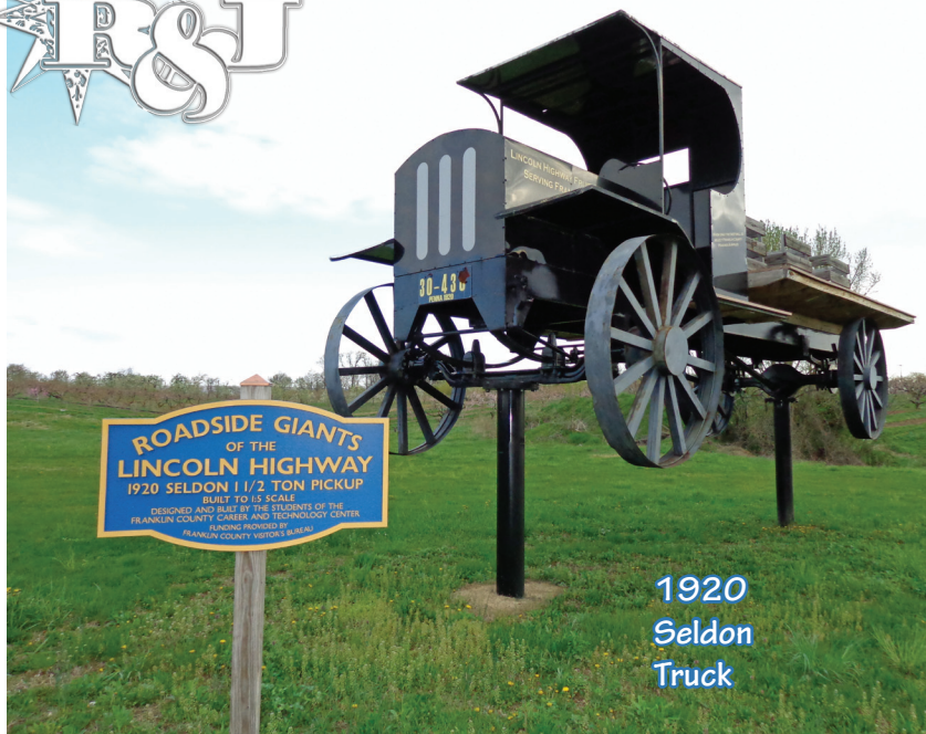
1920 Seldon Truck