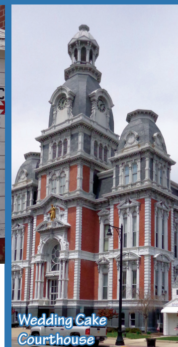
Wedding Cake Courthouse

Please call if you have questions regarding details of this itinerary! 1-800-758-6877