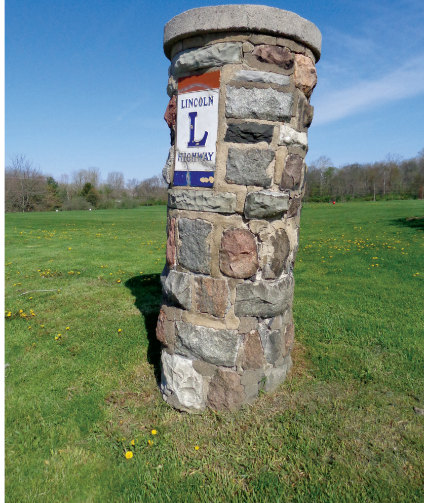
An early Lincoln Highway Roadside Marker