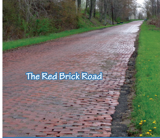
The Red Brick Road

Hotel: Hampton Inn or Holiday Inn Express