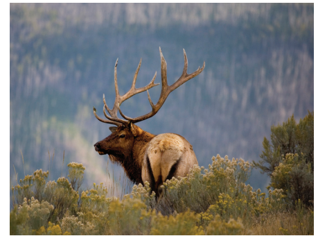
CLOCKWISE STARTING AT LEFT: SPECTACULAR DENALI NATIONAL PARK, A BEAR TAKING INTEREST, AN ELK IN DENALI NATIONAL PARK