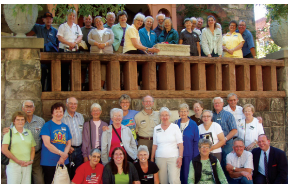
2011 R&J GROUP