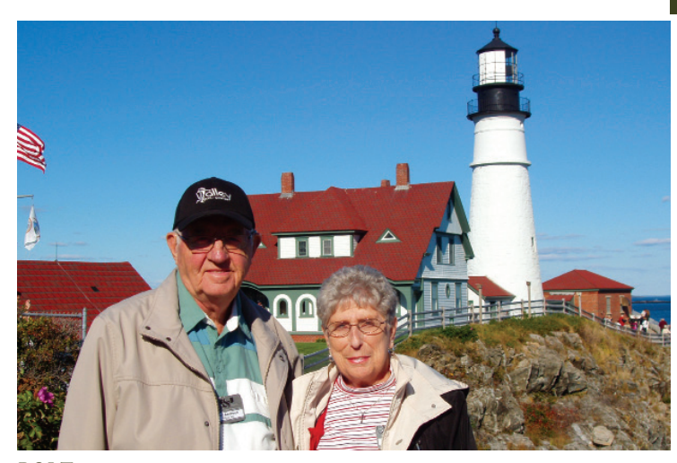
R&J TRAVELERS TAKING A MOMENT TO CAPTURE THIS MEMORY FOR YEARS TO COME!