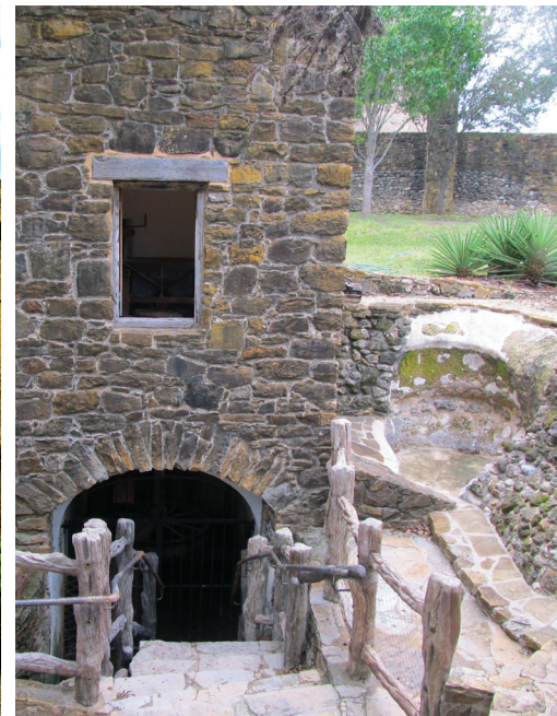
LEFT TO RIGHT: CHRISTMAS TREE - SAN ANTONIO STYLE; BEAUTIFUL DAY AT THE SAN JOSE MISSION; HISTORIC MILL AT SAN JOSE MISSION