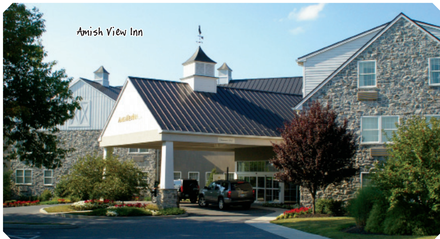
Amish View Inn

After our included breakfast at the hotel, we head to Gettysburg where our first stop is at the famous Hall of Presidents & First Ladies Wax Museum. Next is Gettysburg Battlefield, starting our experience at the brand new state-of-the-art National Battlefield Visitors Center. Enjoy the movie, Civil War Museum, and a convenient boxed lunch before a professionally guided Gettysburg Battlefield