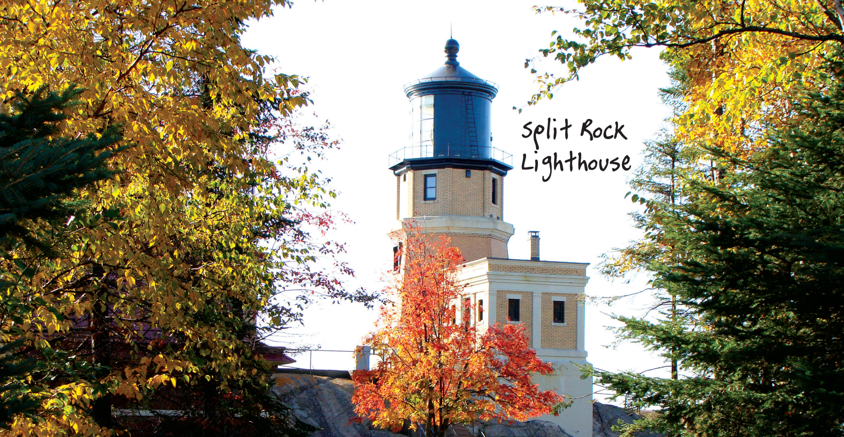
Split Rock Lighthouse