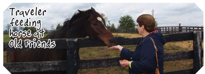
Traveler feeding horse at Old Friends