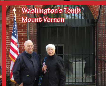
Washington's Tomb Mount Vernon