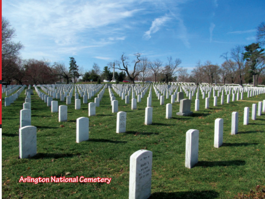
Arlington National Cemetery

Visit Monuments, Memorials, the Smithsonian, Arlington Cemetery, Gettysburg, Mount Vernon & so much more!