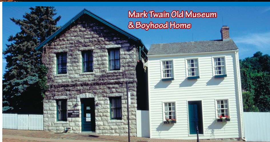
Mark Twain Old Museum & Boyhood Home