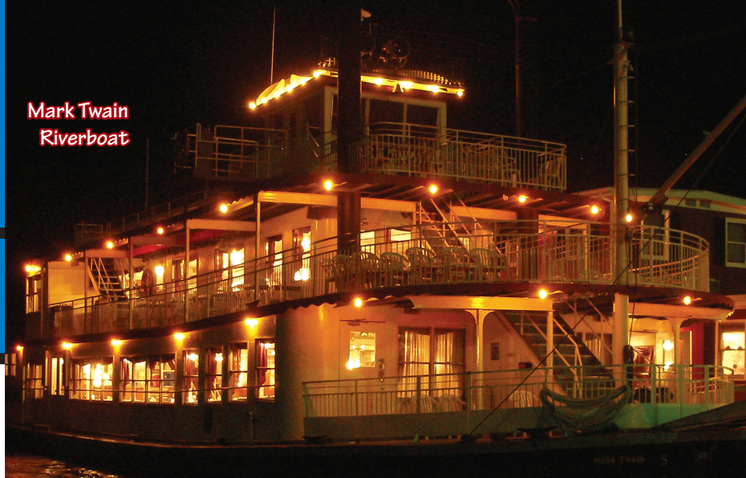
Mark Twain Riverboat