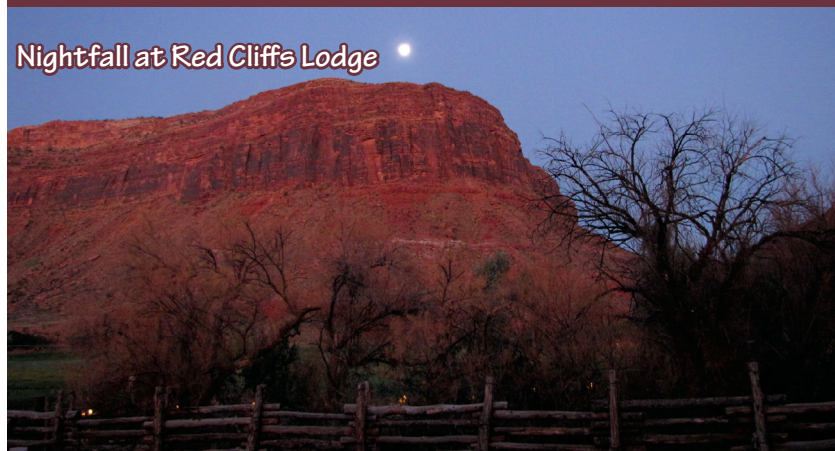
Nightfall at Red Cliffs Lodge