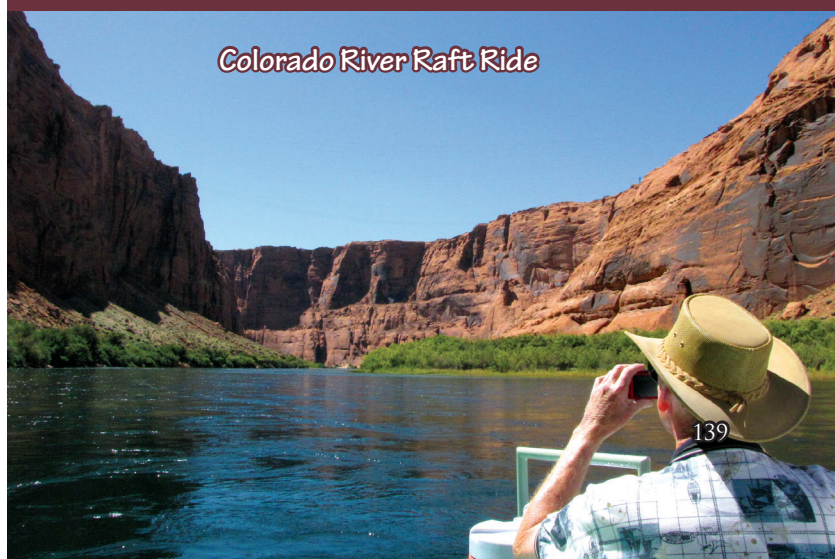
Colorado River Raft Ride