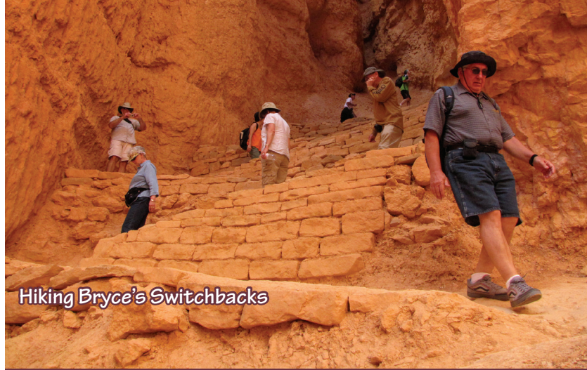
Hiking Bryce's Switchbacks