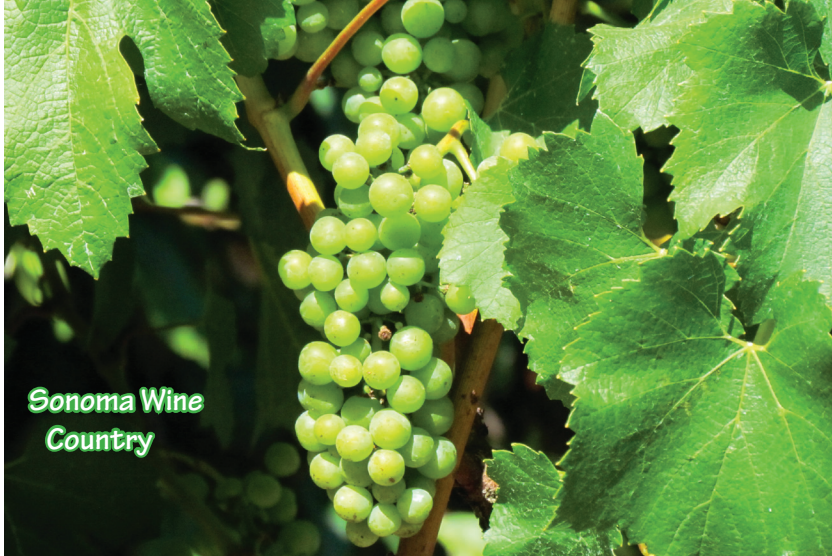
Sonoma Wine Country