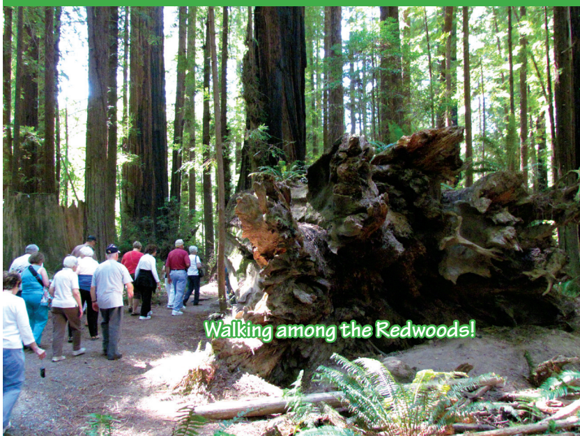
Walking among the Redwoods!