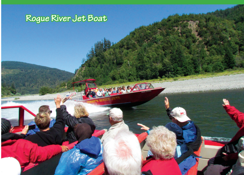
Rogue River Jet Boat