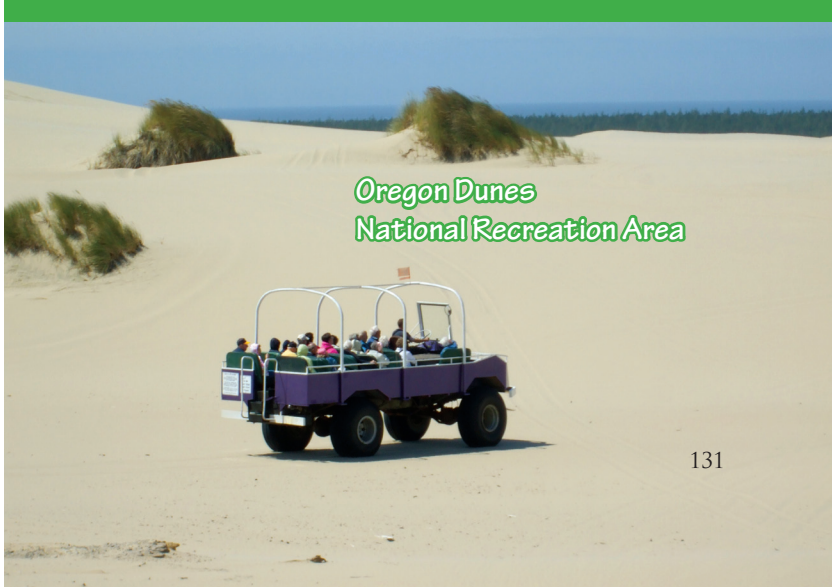
Oregon Dunes National Recreation Area