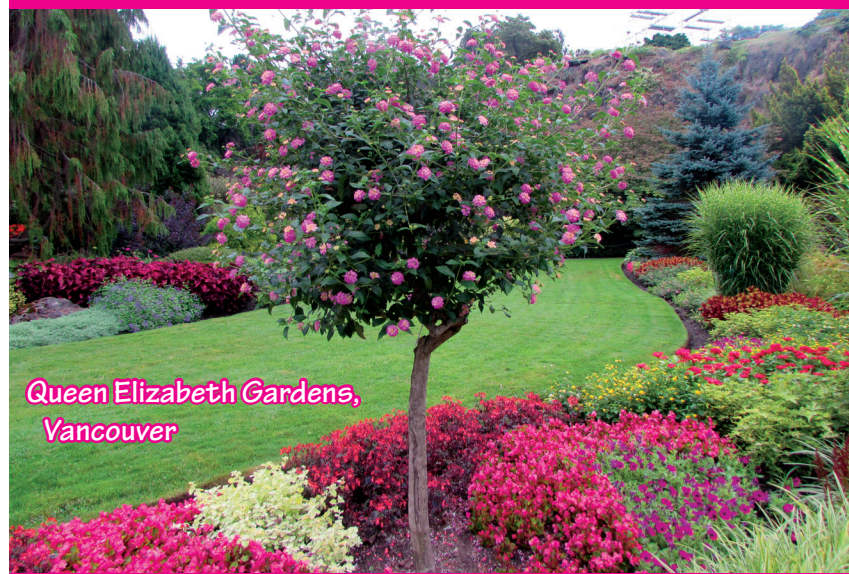
Queen Elizabeth Gardens, Vancouver