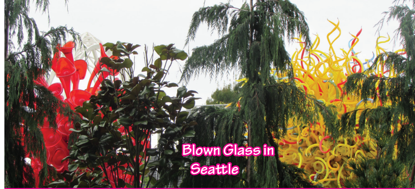
Blown Glass in Seattle