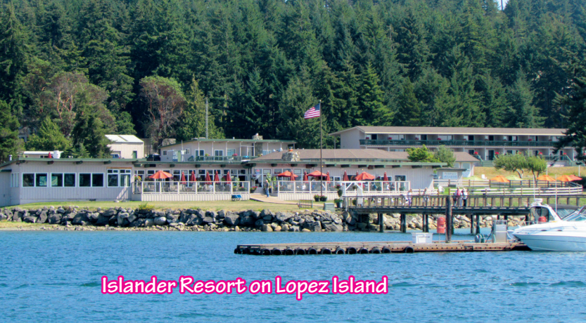
Islander Resort on Lopez Island