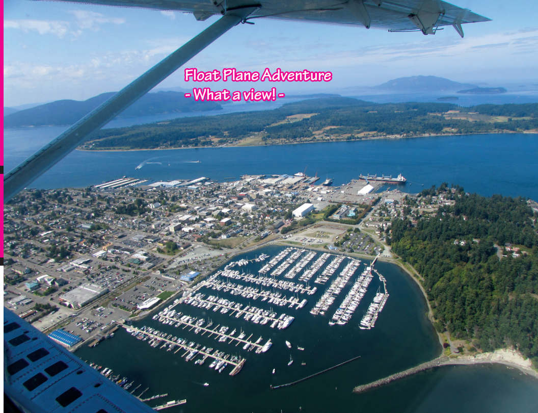
Float Plane Adventure - What a view! -