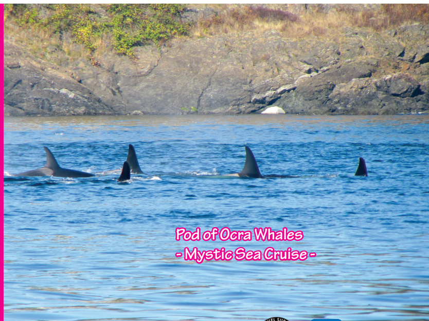
Pod of Orcas Whales - Mystic Sea Cruise -