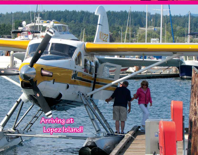
Arriving at Lopez Island!