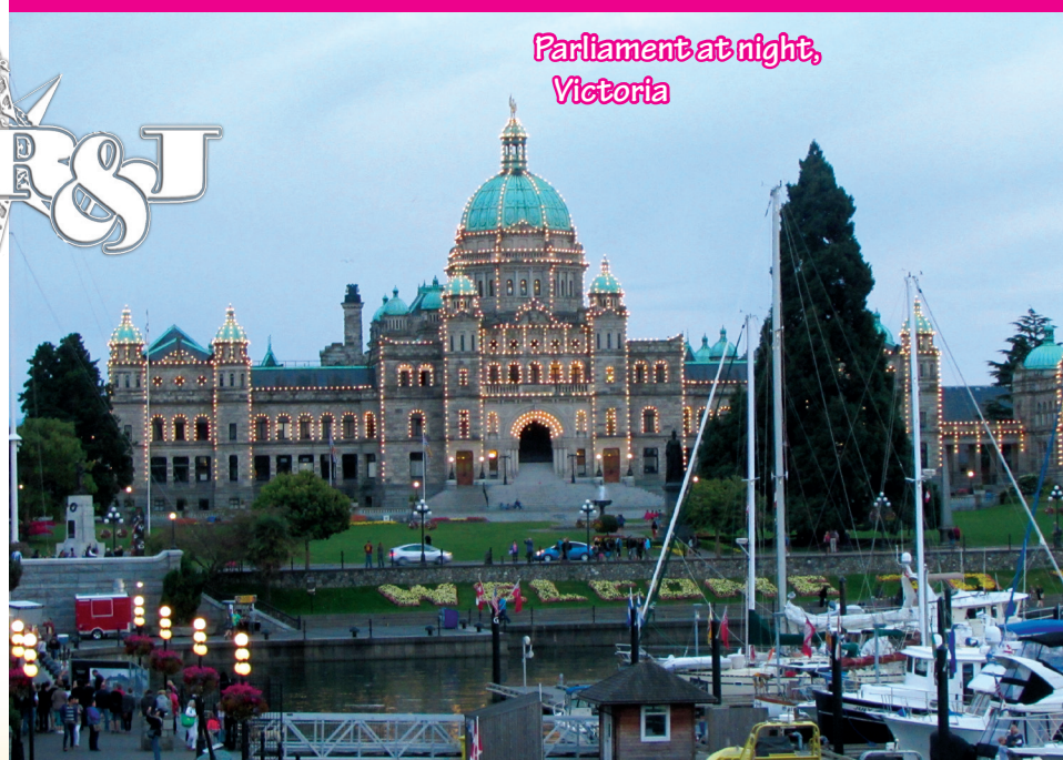
Parliament at night, Victoria