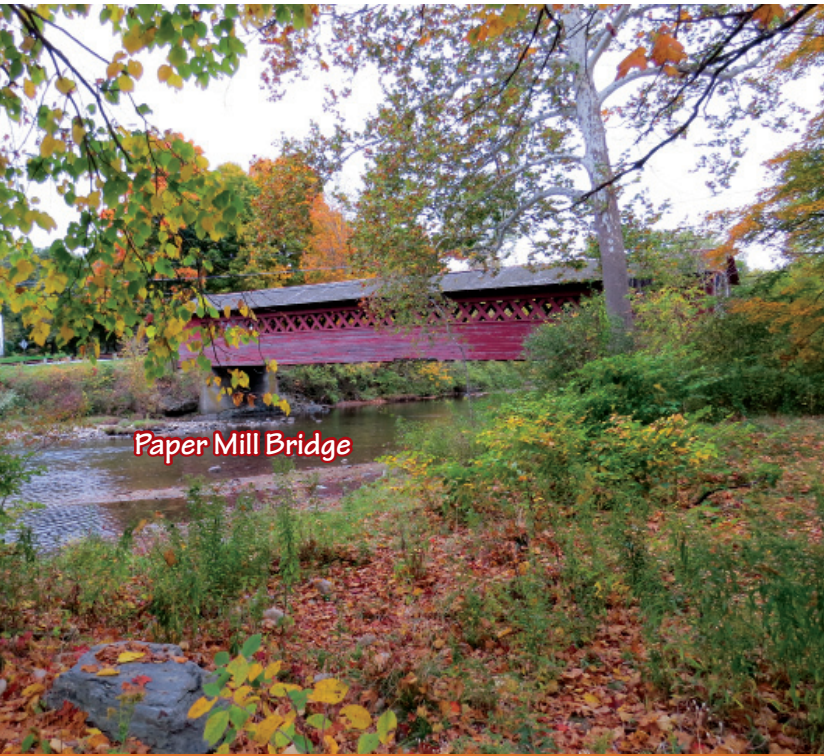
Paper Mill Bridge