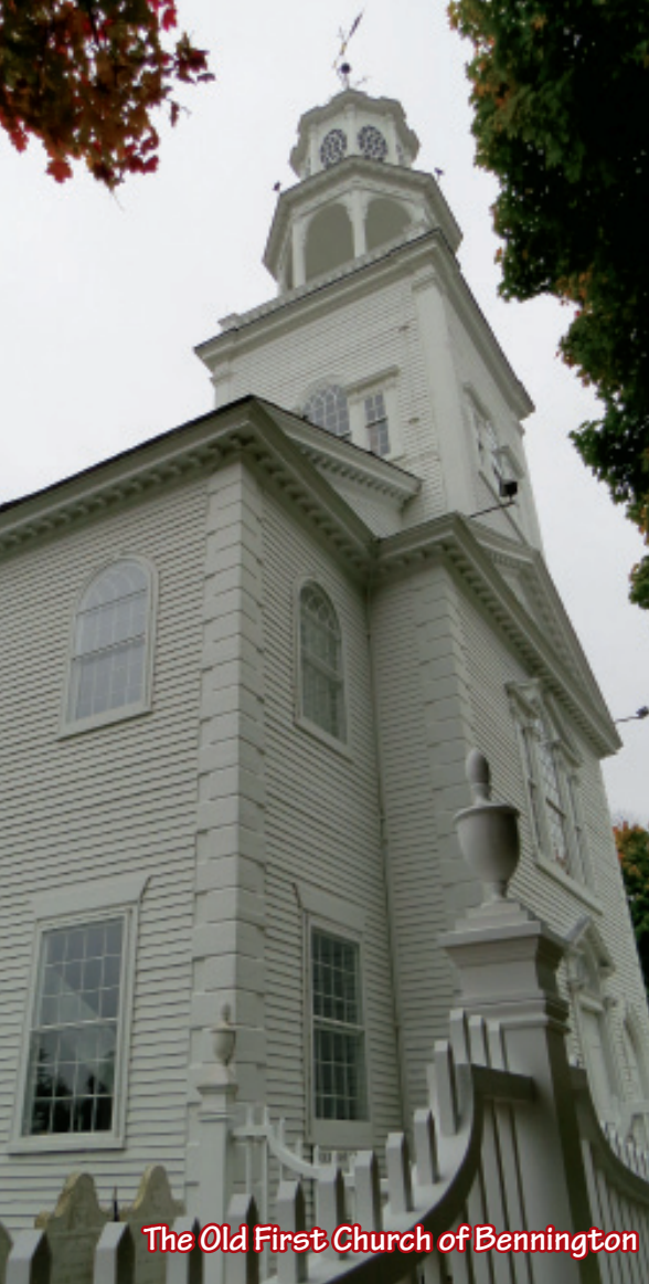
The Old First Church of Bennington