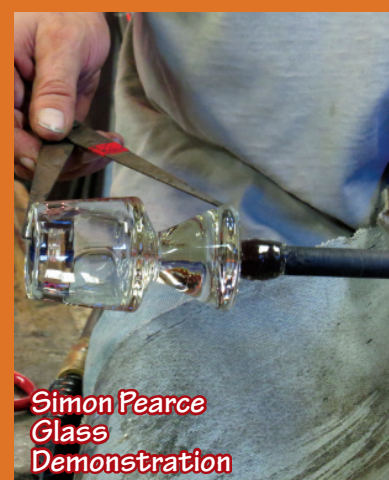
Simon Pearce Glass Demonstration

at one of the many sandwich shops and a chance to view the beautiful State Capitol Building before we journey on to Waterbury. This is no time to contemplate diets as we are stopping at Ben & Jerry's Ice Cream Factory for a tour and ice cream treats. But the best is still ahead as we make our way up a gentle winding mountain road to the Trapp Family Lodge. This gracious European styled mountain retreat is located at the original homestead of the von Trapp family. Famously chronicled in the musical "Sound of Music," the von Trapp Family has been welcoming guests here since 1938. Experience Vermont hospitality at its best at this dreamlike resort lodge overlooking the magical mountain landscape only Vermont and this location can offer. We dine this evening in the relaxed luxury & comfort of the lodge dining room overlooking the valley below. This evening view "The Real Maria" story in the lodge theatre while still having time to stroll the retreat pathways.