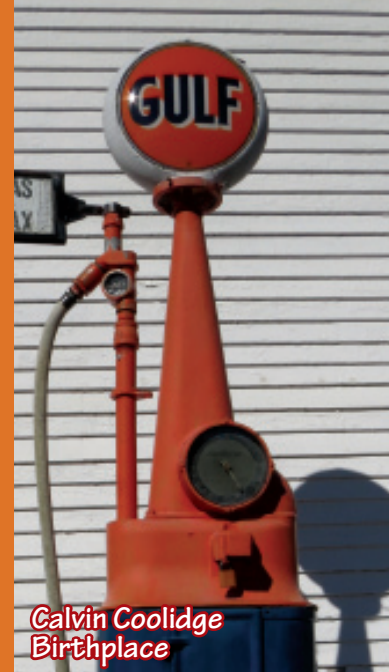
Calvin Coolidge Birthplace