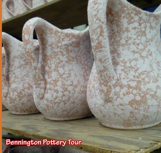
Bennington Pottery Tour