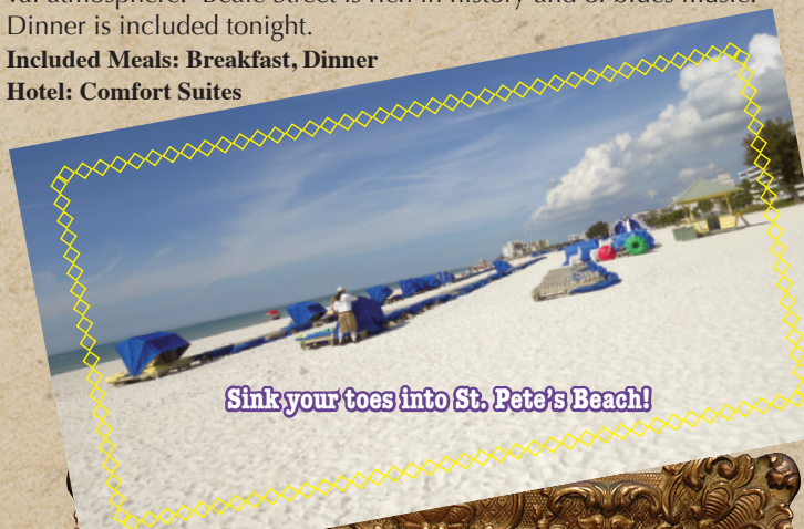
Sink your toes into St. Pete's Beach!