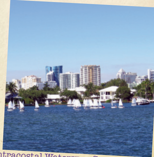
Intracostal Waterway Cruise

includes alligators, turtles, manatees, deer, and birds. We'll board a river boat for a fascinating ranger-led tour along the Wakulla River. Lunch is served right here at the Spring, providing wonderful views! Then we depart Florida and make our way to Montgomery, AL.