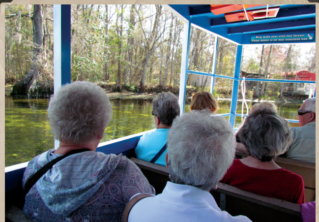
Wakulla Springs Boat Adventure

After breakfast we make a short drive to Wakulla Springs State Park, home to one of the largest and deepest freshwater springs in the world. This park plays host to an abundance of wildlife which