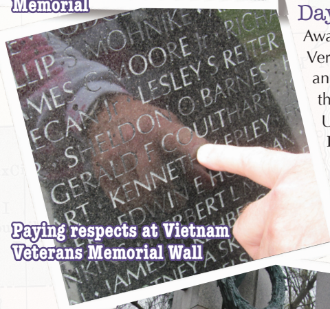
Paying respects at Vietnam Veterans Memorial Wall