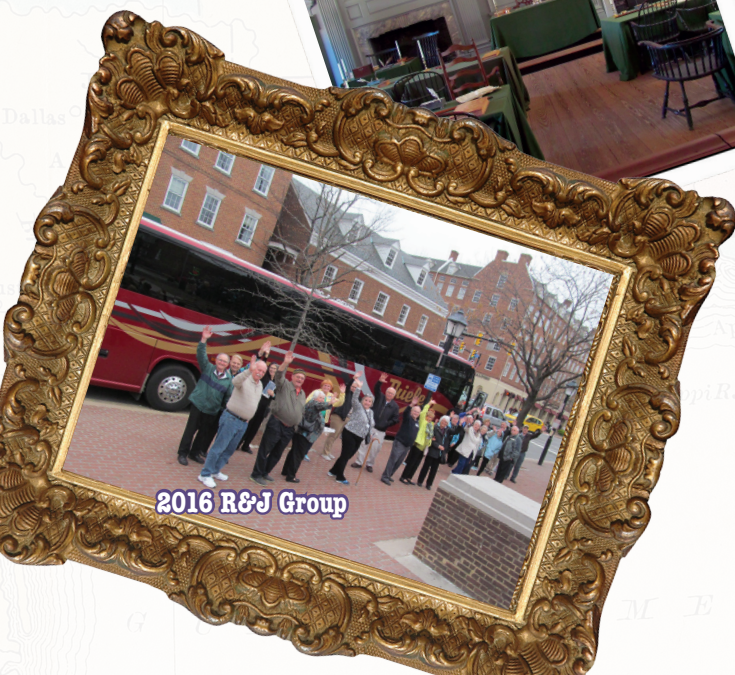
2016 R&J Group