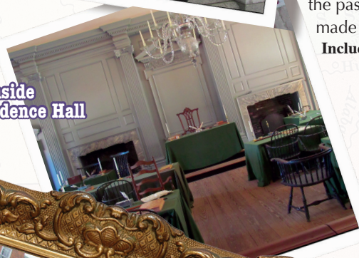
Inside Independence Hall