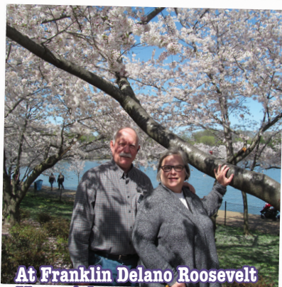
At Franklin Delano Roosevelt Memorial

will be a stop for lunch at the restored Union Station. Dinner is served at Kings Street Blues Restaurant in Old Town, Alexandria VA. It serves the best comfort food in town with hospitality to match. An impressive day!