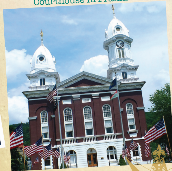
Courthouse in Franklin

Relax this morning as we enjoy breakfast at the Inn, overlooking the peaceful Amish farmland, before we depart for our nostalgic ride on