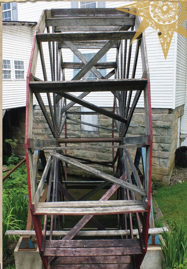
Volant Mills Waterwheel

the Middletown & Hummelsville Railroad. We will travel in style in 1920's vintage coaches. We then head to Hershey for a sweet tour of the chocolate factory where the streetlights are made like Candy Kisses. Next our trip to the World Class Auto & Bus Museum will be fascinating! It features automobiles from eight decades of time traveling from New York to San Francisco. Also featured is the largest number of vintage buses in the country under one roof. Dinner tonight will be at the famous, award-winning Miller's Smorgasbord before returning to our hotel for the evening.