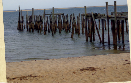
Oak Bluff’s Cottage City