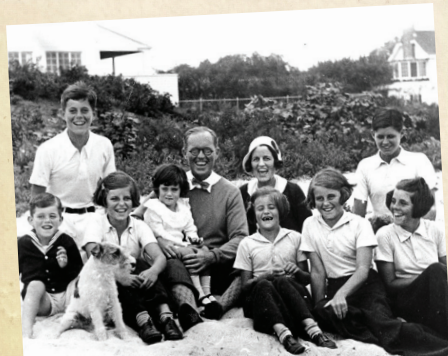
Hyannis Port - 1931 Kennedy Family (JFK top left)

"I always come back to the Cape and walk on the beach when I have tough decisions to make. The Cape is the one place I can think and be alone." John Fitzgerald Kennedy