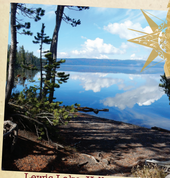
Lewis Lake, Yellowstone