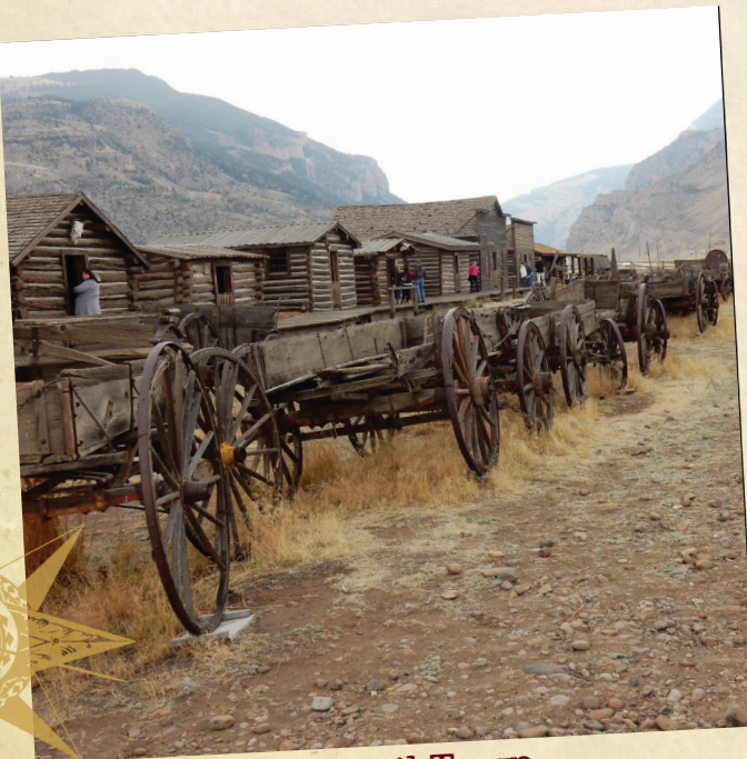
Old Trail Town