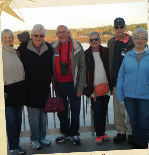
St. Andrew by the Sea