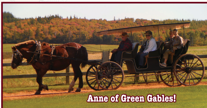
Anne of Green Gables!

Our day starts off with a visit to the Kensington Train Station, which was built in 1905. Discover Green Gables, the literary home of Lucy Maud Montgomery's "Anne of Green Gables." Visiting the Museum, taking a horse & buggy ride, visiting the Green Gables House, walking the Haunted Woods and Lover's Lane will bring this classic to life! Our continued tour of this lovely island will display the magnificent beaches of Prince Edward Island National Park and the rich farmlands of red soil and rolling hillsides with the beautiful Atlantic Ocean as a backdrop. Prince Edward Island is famous for its lobster, so what better place to learn about the fishing industry in