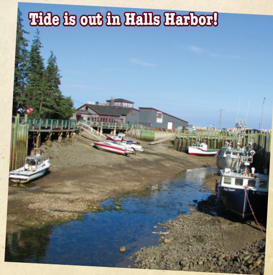
Tide is out in Halls Harbor!