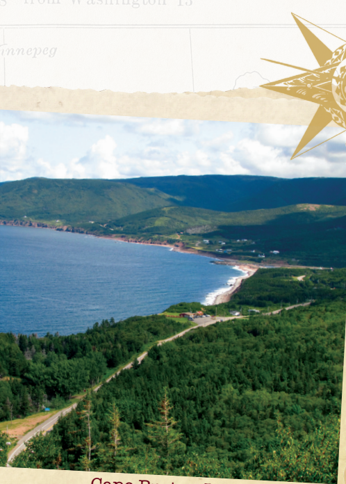
Cape Breton Island