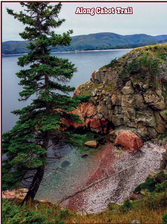
Along Cabot Trail