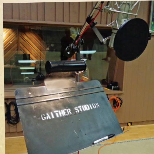
Gaither Recording Studio

Following our nice hot breakfast we journey just a few short miles away to another critical branch of The Samaritan's Purse. This is the distribution center where we witness the fascinating logistics