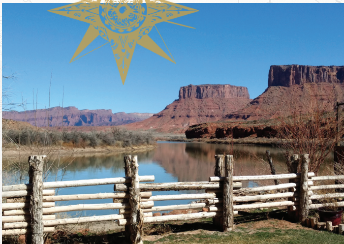
Incredible view during lunch at Red Cliffs Lodge

Lions, tigers and bears...oh my! Today we head to the San Diego Zoo where you will see the largest koala colony outside of Australia! Ever wonder what a Tasmanian Devil looks like...you'll find out here! View the giant Panda and get a glimpse of the Pygmy Hippopotamus,