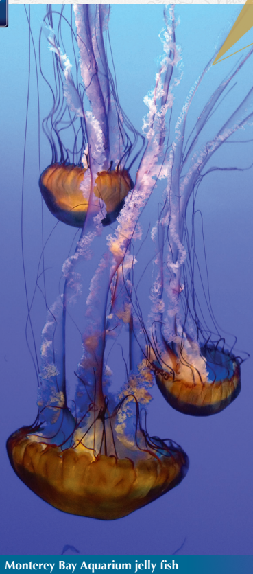
Monterey Bay Aquarium jelly fish