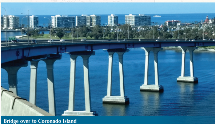
Bridge over to Coronado Island