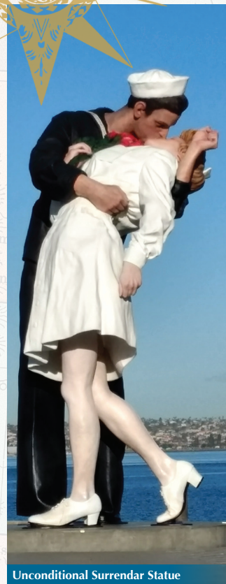
Unconditional Surrender Statue