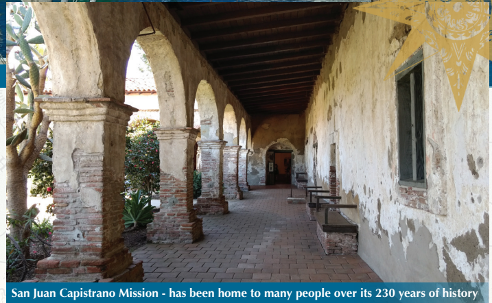
San Juan Capistrano Mission - has been home to many people over its 230 years of history

This morning we take a scenic drive along Highway 101 up to