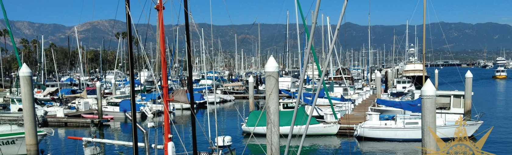
View from lunch at Chuck's Waterfront Grill in Santa Barbara

plus much more! Your day will be filled with special experiences and entertaining animals! The remainder of the day is yours to enjoy as you wish.