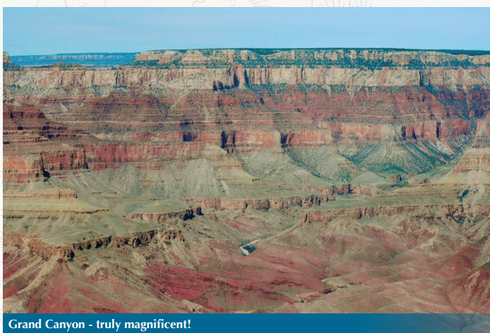
Grand Canyon - truly magnificent!