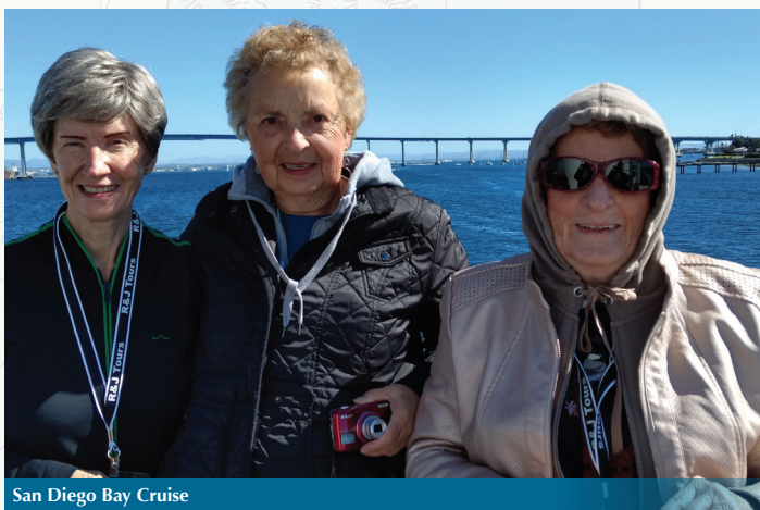
San Diego Bay Cruise