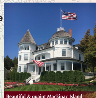
Beautiful & quaint Mackinac Island