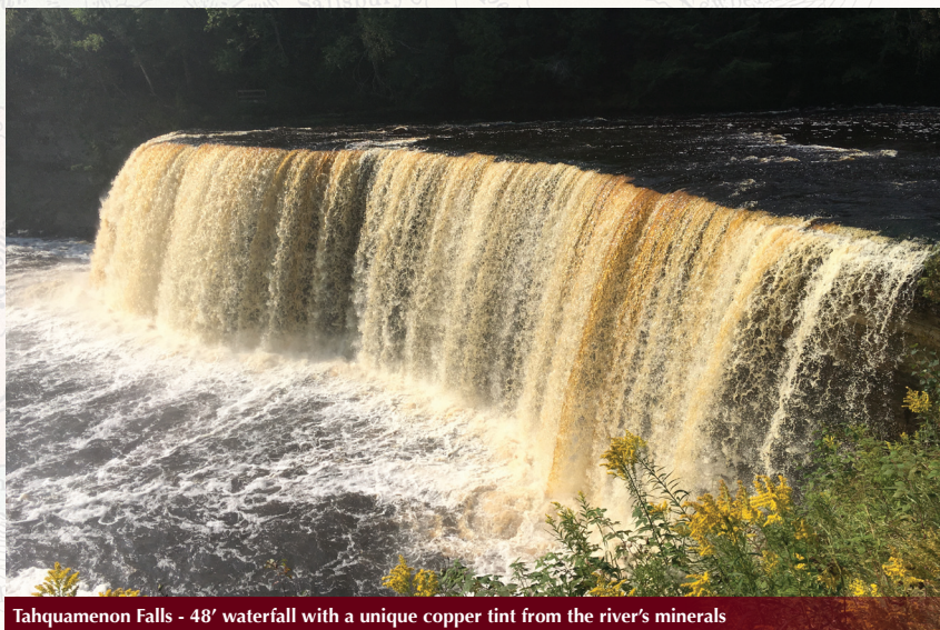
Tahquamenon Falls - 48' waterfall with a unique copper tint from the river's minerals