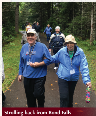
Strolling back from Bond Falls