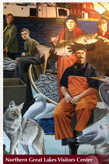
Northern Great Lakes Visitors Center