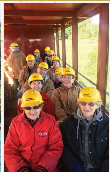
Quincy Mine here we come!