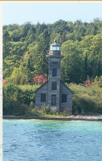
East Channel Lighthouse on Grand Island