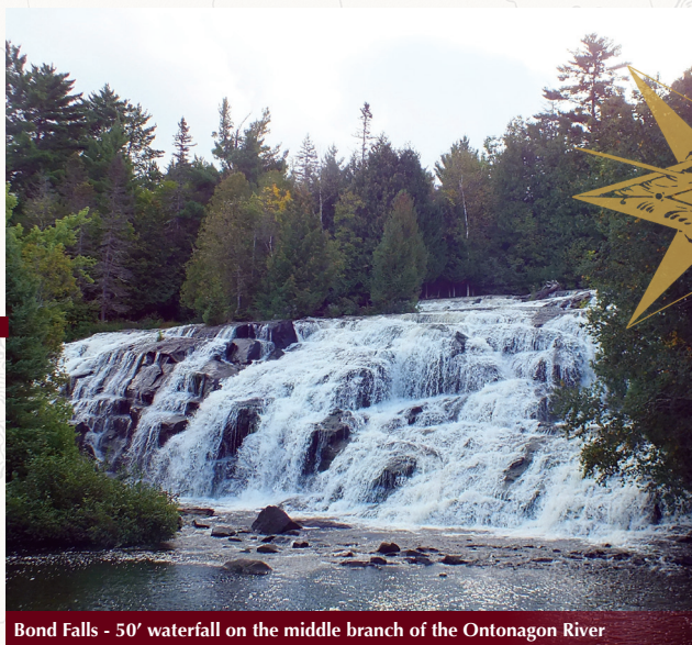
Bond Falls - 50' waterfall on the middle branch of the Ontonagon River

Hugging the shoreline, we make our way along the northern most edge of the peninsula before we begin our ascent to the top of Brockway Mountain. As the highest scenic roadway between the Alleghenies and the Rockies, it offers spectacular views of Lake Superior's rocky coast a thousand feet below. Copper Harbor is as far north as you can go in Michigan. You are definitely no longer in your neighborhood backyard and we are certainly rewarded for taking the time to get here. It is lunch time and with few places able to host a coach group, we found a wonderful