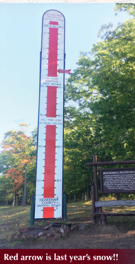
Red arrow is last year's snow!!