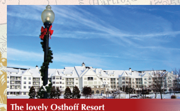
The lovely Osthoff Resort

offering unmistakable Old World Charm, has earned the prestigious AAA Four Diamond rating, making it one of the premier resort destinations in the Midwest. In 2002, the Wisconsin Innkeepers Association presented The Osthoff Resort's general manager with its coveted "Innkeeper of the Year" award.