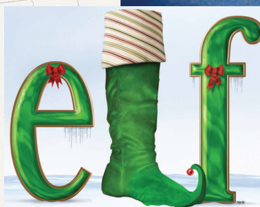
The Broadway Musical