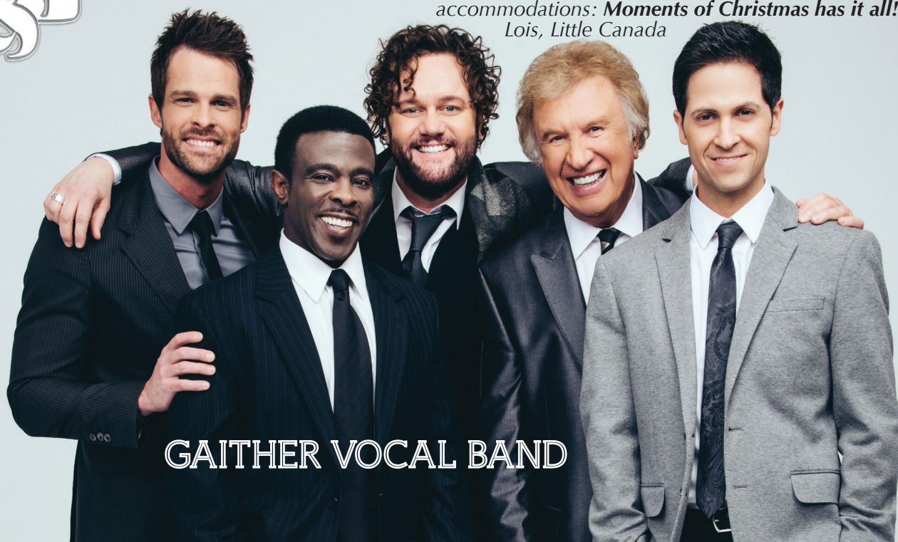
GAITHER VOCAL BAND

"Great entertainment, wonderful food, beautiful accommodations: Moments of Christmas has it all! " Lois, Little Canada