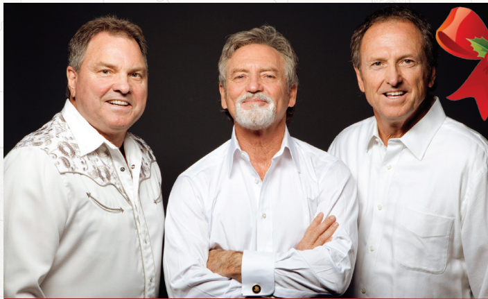
Larry Gatlin & the Gatlin Brothers