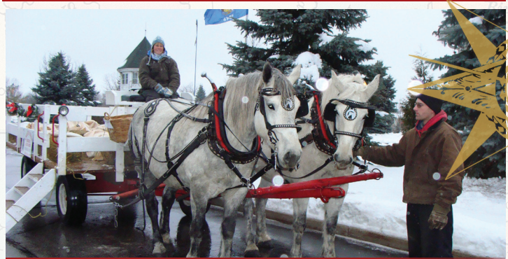
Hayride at The Osthoff - "Giddy up jingle horse pick up your feet!"