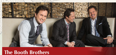
The Booth Brothers