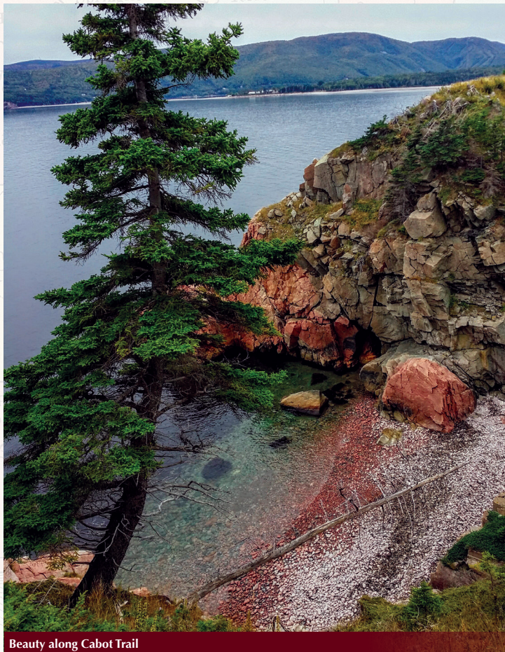
Beauty along Cabot Trail