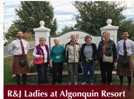
R&J Ladies at Algonquin Resort