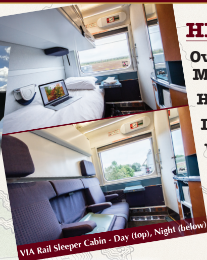
VIA Rail Sleeper Cabin - Day (top), Night (below)