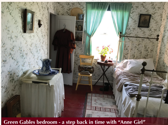
Green Gables bedroom - a step back in time with "Anne Girl"