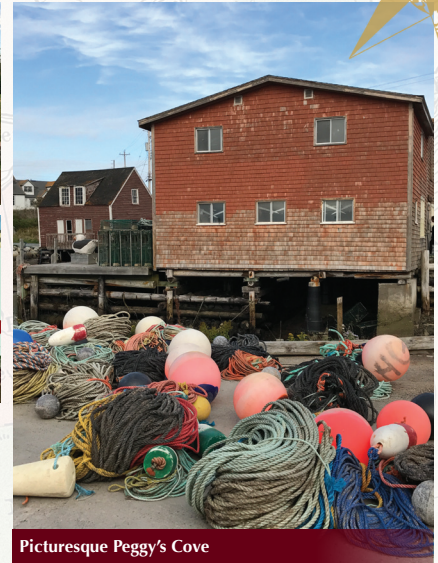
Picturesque Peggy's Cove