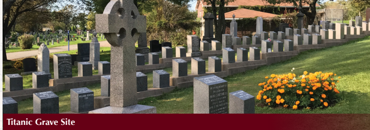
Titanic Grave Site