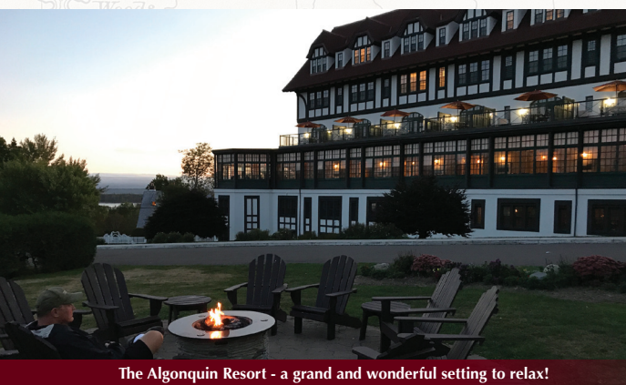
The Algonquin Resort - a grand and wonderful setting to relax!