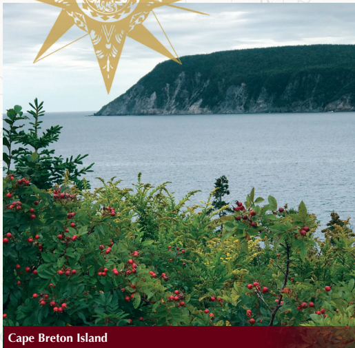
Cape Breton Island