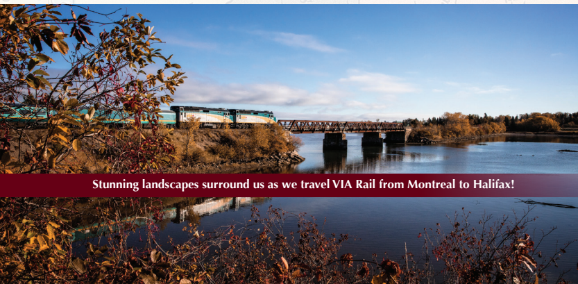
Stunning landscapes surround us as we travel VIA Rail from Montreal to Halifax!

your cozy sleeper cabin complete with private bathroom, and at night your attendant will convert the seating into one lower & one upper bed. Imagine departing Montreal just as dusk is falling, shrouding the city skyline as you pull through the Monteregie Hills, distant lights marking the small towns that pass by on our journey east. Enjoy a freshly prepared dinner of regional specialties this evening in the dining car. After dinner you may relax in the lounge or catch a wine tasting in the dome car. This evening let the rhythm of the train lull you to sleep!