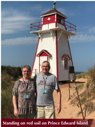
Standing on red soil on Prince Edward Island