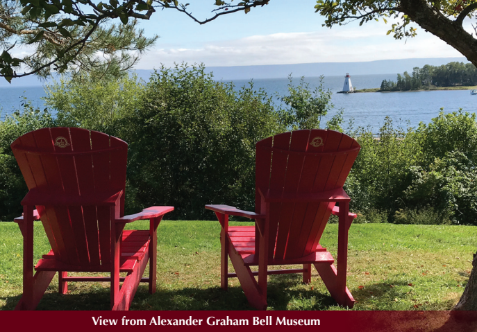
View from Alexander Graham Bell Museum