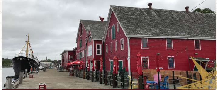
Fisheries Museum of the Atlantic - Halifax