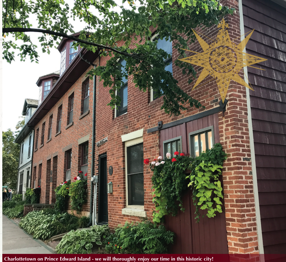
Charlottetown on Prince Edward Island - we will thoroughly enjoy our time in this historic city!