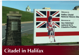
Citadel in Halifax