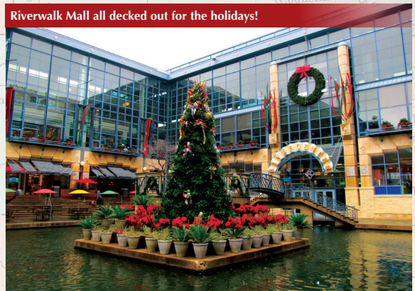
Riverwalk Mall all decked out for the holidays!