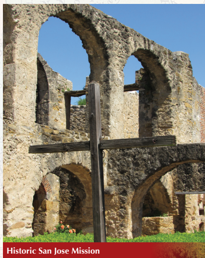
Historic San Jose Mission