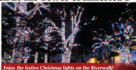
Enjoy the festive Christmas lights on the Riverwalk!