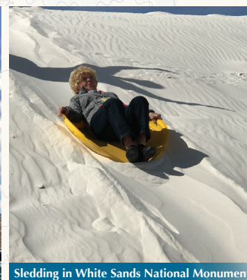
Sledding in White Sands National Monument