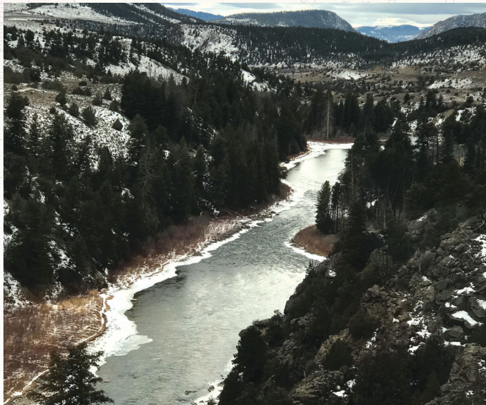
As we travel by Amtrak in Colorado, the passing scenery is fabulous!