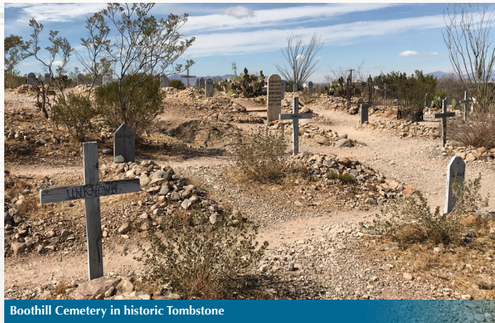
Boothill Cemetery in historic Tombstone