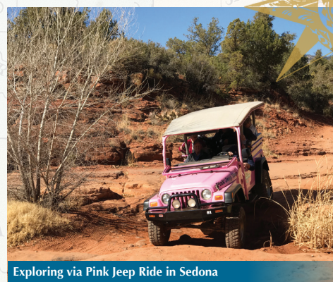
Exploring via Pink Jeep Ride in Sedona