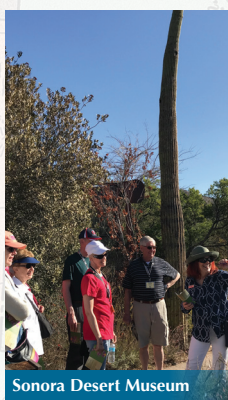
Sonora Desert Museum