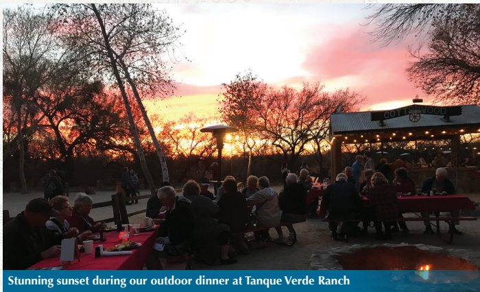
Stunning sunset during our outdoor dinner at Tanque Verde Ranch