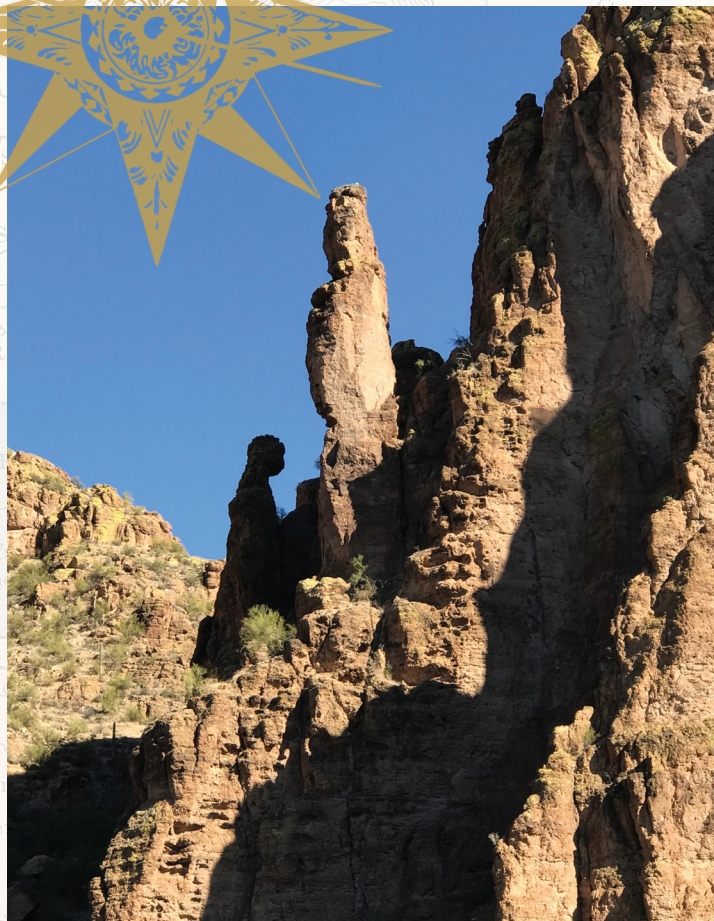
Stunning view while cruising Desert Canyon Lake by steamboat!