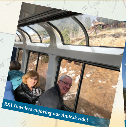
R&J Travelers enjoying our Amtrak ride!

January 30 - February 15, 2019 (17 days)