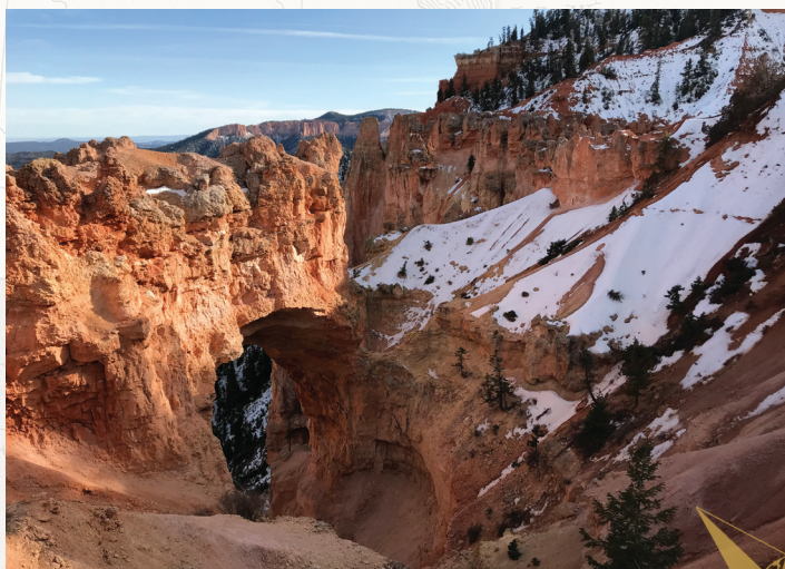
Breaktaking Bryce Canyon