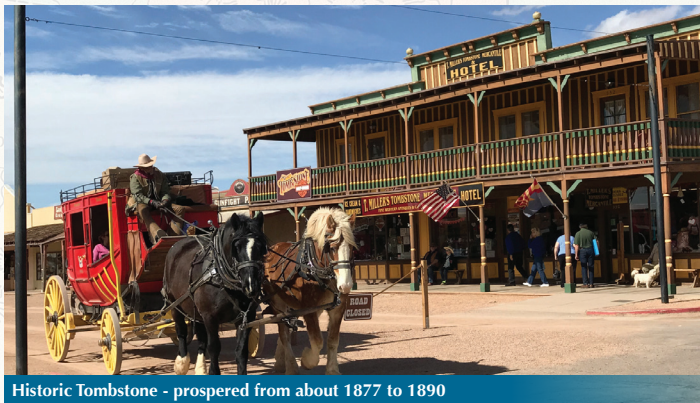
Historic Tombstone - prospered from about 1877 to 1890