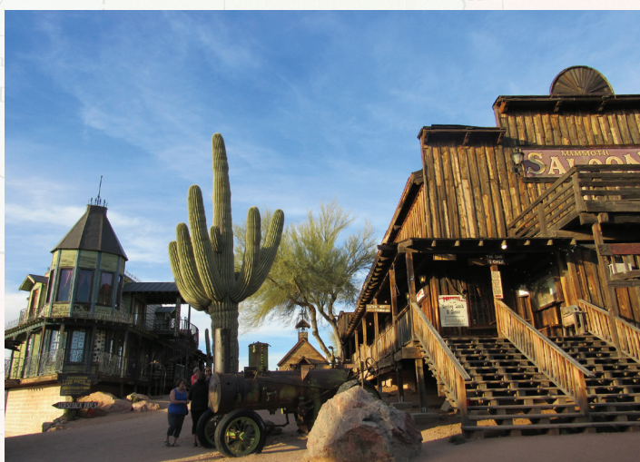
Goldfield Ghost Town - est. in 1893, this once was a thriving town on the Apache Trail