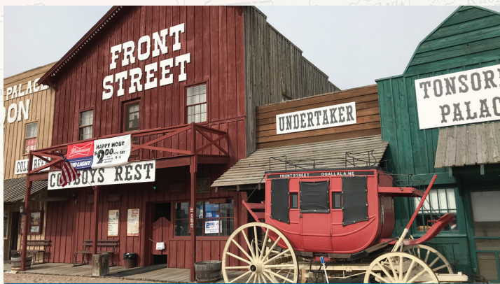
The one & only Ogallala, Nebraska!