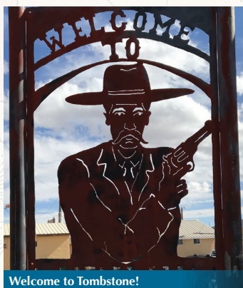
Welcome to Tombstone!