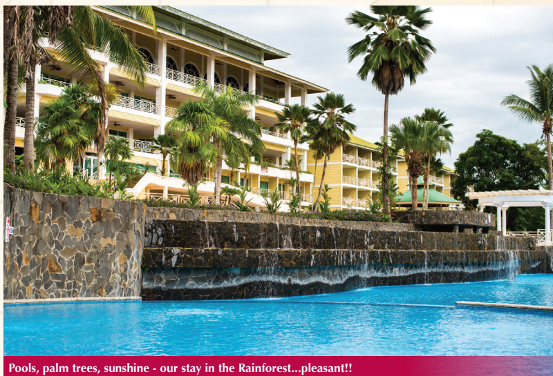
Pools, palm trees, sunshine - our stay in the Rainforest...pleasant!!