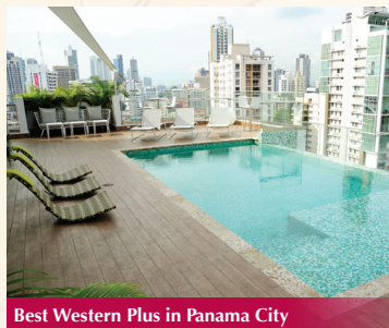
Best Western Plus in Panama City

Hotel: The Westin Playa Bonita or similar (2 Nights)