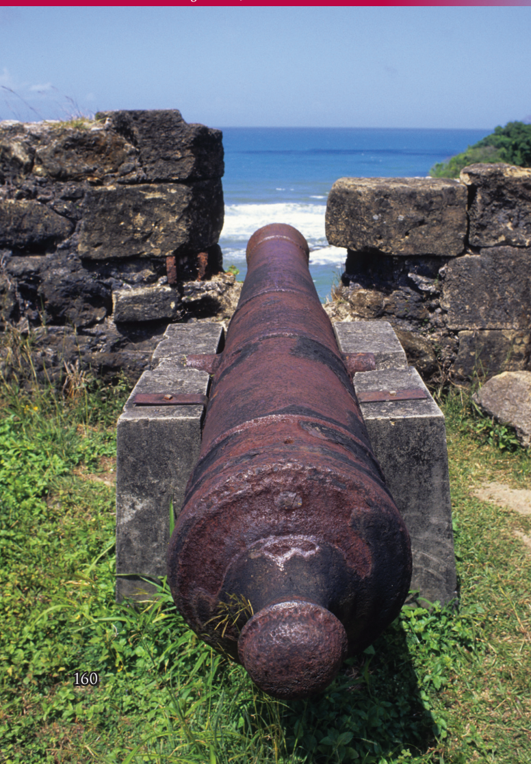
Visit historic Santiago & San Jeronimo Forts in Portobelo