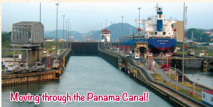
Moving through the Panama Canal!