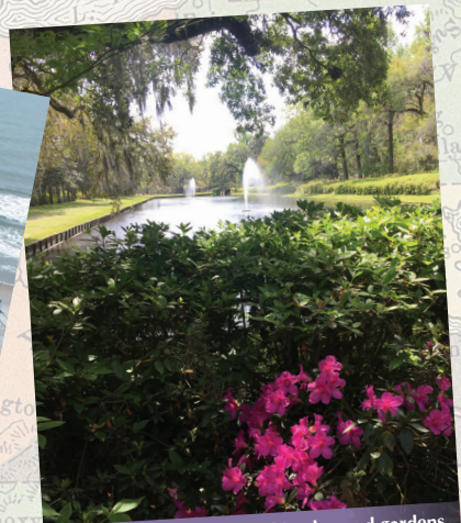
Middleton Place's beautiful landscaped gardens