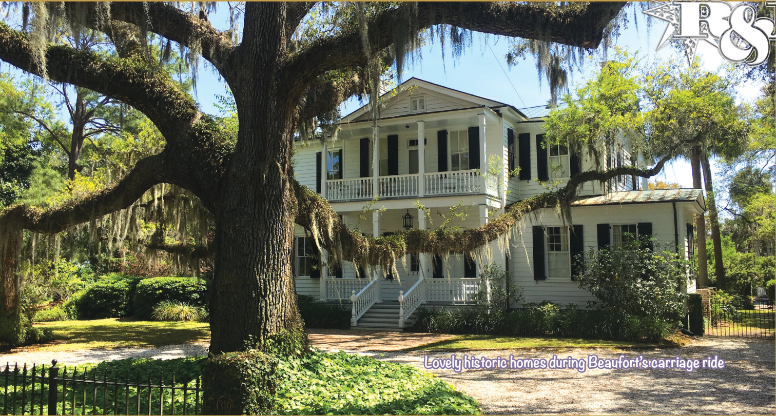
Lovely historic homes during Beaufort's carriage ride