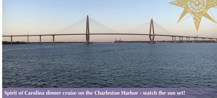
Spirit of Carolina dinner cruise on the Charleston Harbor - watch the sun set!