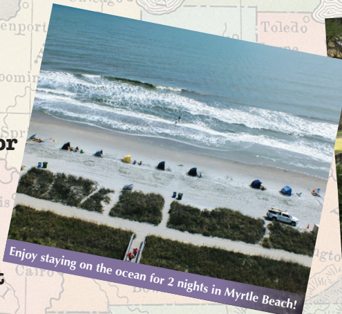
Enjoy staying on the ocean for 2 nights in Myrtle Beach!