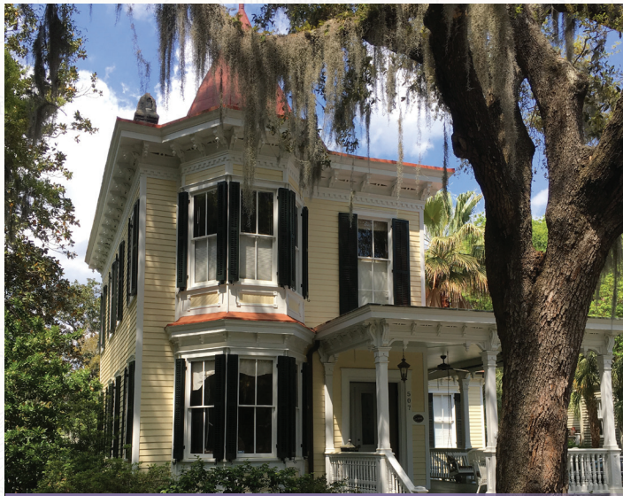
Another southern beauty we pass during our horse-drawn Beaufort carriage ride!