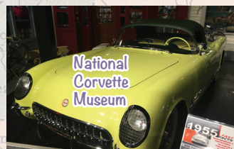
National Corvette Museum