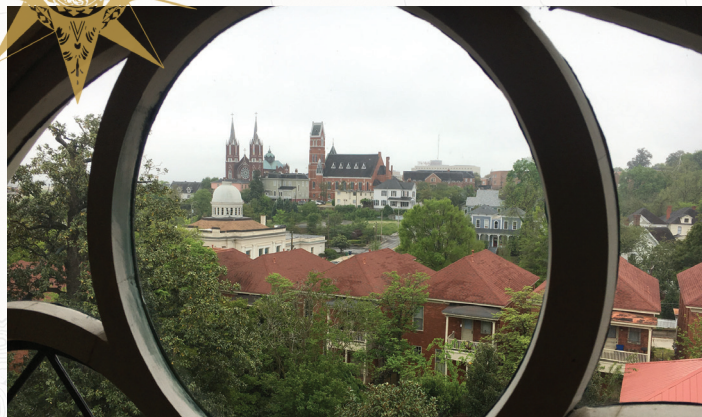
Incredible view from inside the Hay House in Macon of four churches!