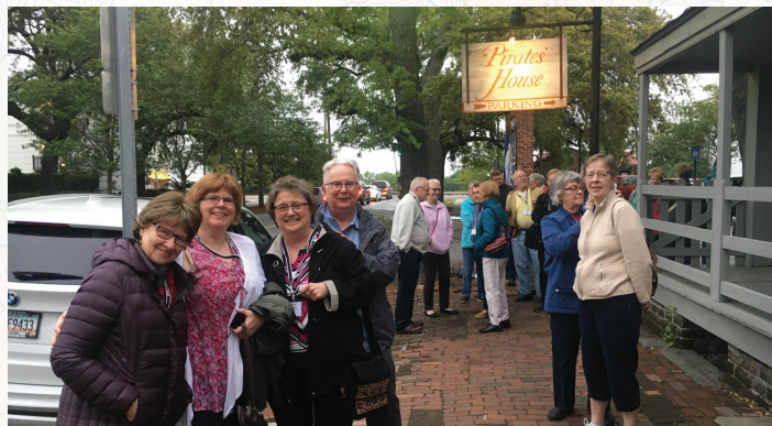
Dinner is served at the historic and lively Pirates House - these travelers are satisfied!