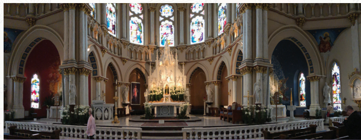
In Macon we will visit St. Joseph's Catholic Church