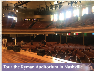
Tour the Ryman Auditorium in Nashville