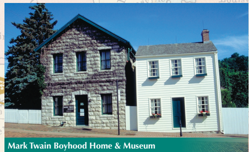
Mark Twain Boyhood Home & Museum