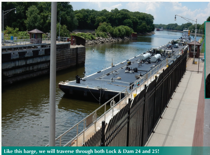
Like this barge, we will traverse through both Lock & Dam 24 and 25!