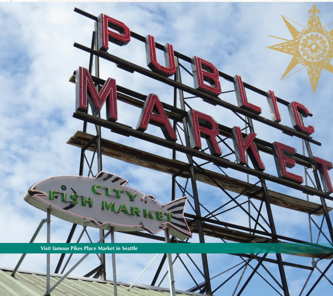
Visit famous Pikes Place Market in Seattle

Breakfast is served early this morning, then we depart Tacoma for a spectacular & scenic day as we will make our way to Port Angeles. We will experience the diversity of Olympic National Park as we enter into the Park multiple times. Enjoy stopping at breathtaking Lake Quinalt; seeing the Hoh Rainforest, one of the largest and few temperate rainforests in the world; and driving along the shoreline of beautiful Lake Crescent, complete with a photo stop! Our journey today also includes lunch along Washington's coast! Arriving in Port Angeles, a picturesque town nestled where the snowcapped Olympic Mountains meet the calm roll of the sea, we will check into the Red Lion Hotel for the next 4 nights. This property is located right on the beach of the beautiful Strait of Juan de