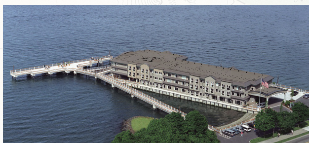
Stay 5 nights on the waterfront in Tacoma - what a perfect setting!!