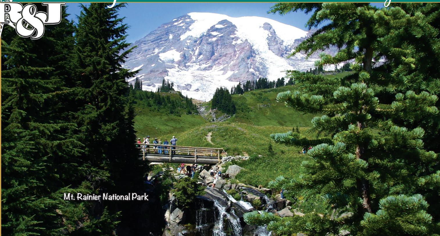
Mt. Rainier National Park