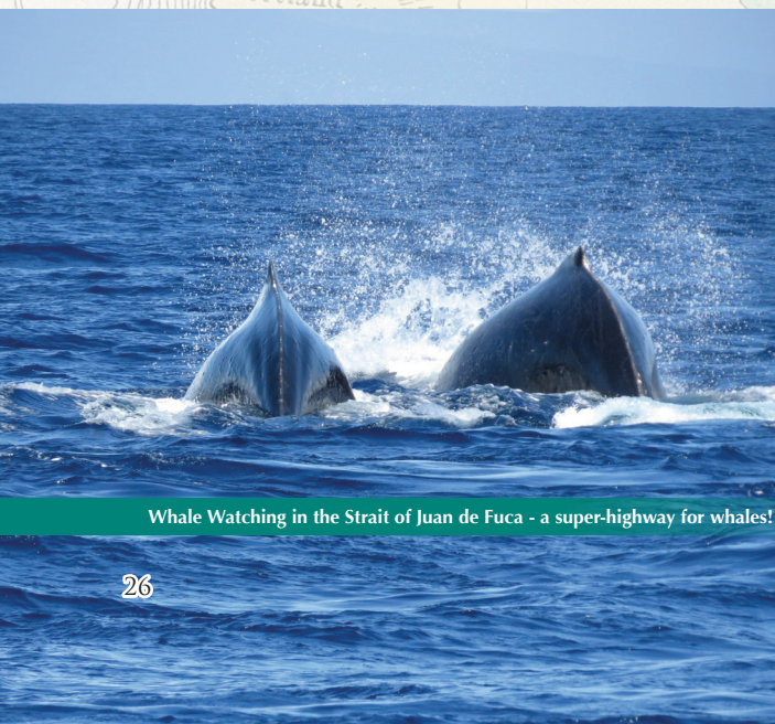
Whale Watching in the Strait of Juan de Fuca - a super-highway for whales!