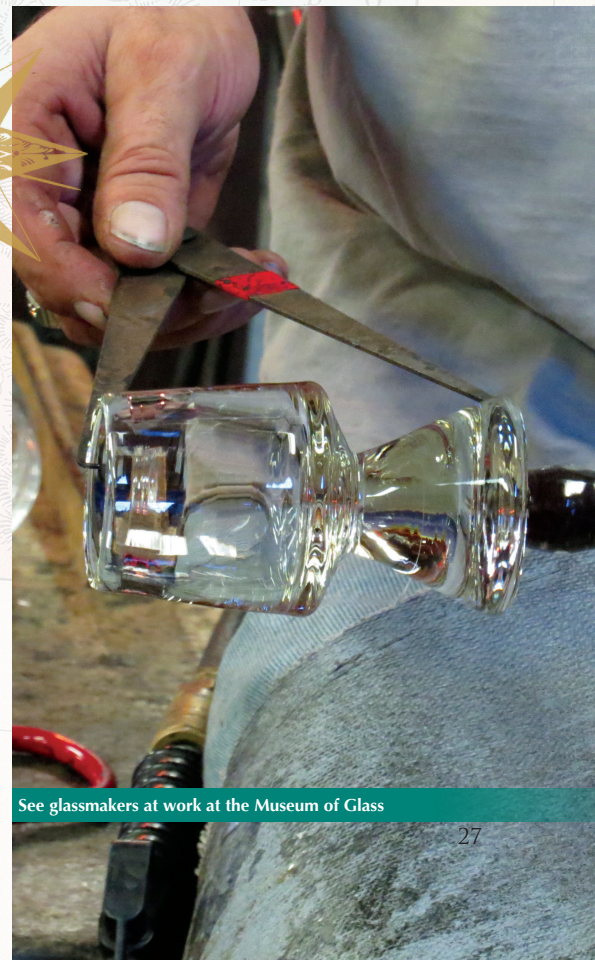
See glassmakers at work at the Museum of Glass