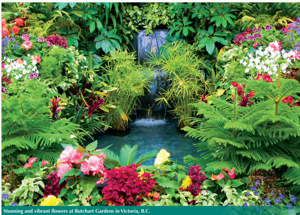
Stunning and vibrant flowers at Butchart Gardens in Victoria, B.C.

In Port Angeles our hotel is stretched out right along the beach of the Strait of Juan de Fuca!