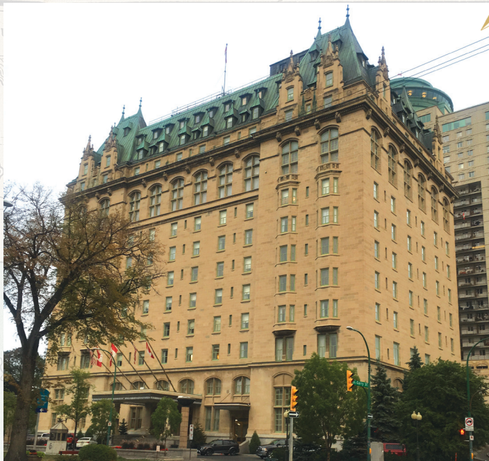
Stay 4 nights at the Historic Fort Garry Hotel where fresh coffee is delivered to your room!