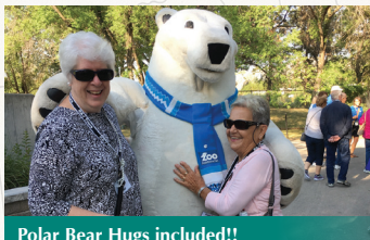
Polar Bear Hugs included!!