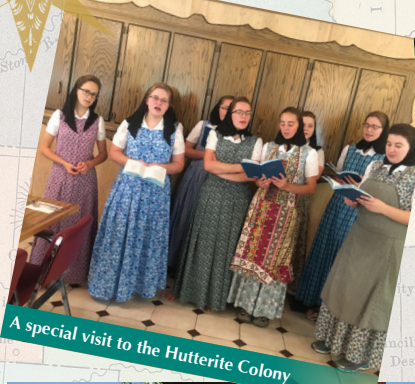
A special visit to the Hutterite Colony