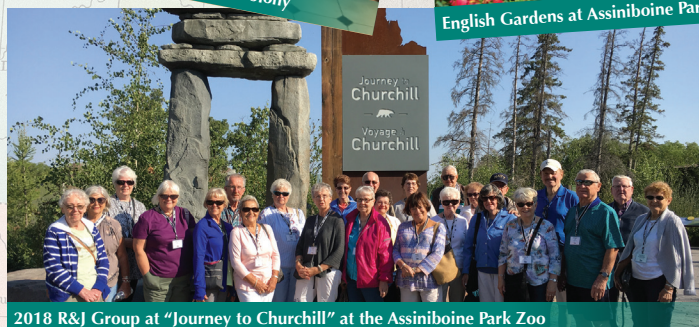
2018 R&J Group at "Journey to Churchill" at the Assiniboine Park Zoo