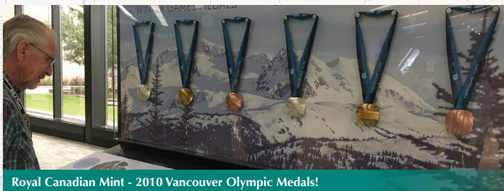
Royal Canadian Mint - 2010 Vancouver Olympic Medals!

you may choose to visit the Forks, Winnipeg's number one tourist destination, located at the junction of the Assiniboine & mighty Red Rivers. The Forks has been a meeting place for over 6,000 years for early Aboriginal trading, fur trading, Scottish settlers, and tens of thousands of immigrants. Rich in history and natural beauty, it now has an array of dining and shopping experiences.