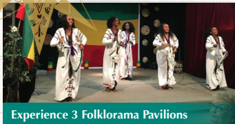
Experience 3 Folklorama Pavilions

After breakfast we tour the Winnipeg Royal Canadian Mint, a state-of-the-art manufacturing facility established in 1976. They say that money makes the world go 'round' and here's our chance to see first-hand where it all begins. Then we visit Fort Gibraltar on the banks of the Red River, where colorful characters living to the "beat" of 1815 greet us & take us to a world away. Once a North West Company fur trade post, Fort Gibraltar reflects the lifestyle of the settlement and the roles played by the Metis, settlers, explorers, aboriginal people and the adventuresome voyageurs. Visit the Trading Post, Workshop, Blacksmith's Shop, and more before enjoying a traditional French lunch at the Fort. Next we head to the Canadian Museum for Human Rights, which will take us on a journey of education and inspiration unlike anything we've experienced before. Afterwards we'll return to the hotel, which is within walking distance to the Forks. During some free time