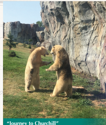
"Journey to Churchill"