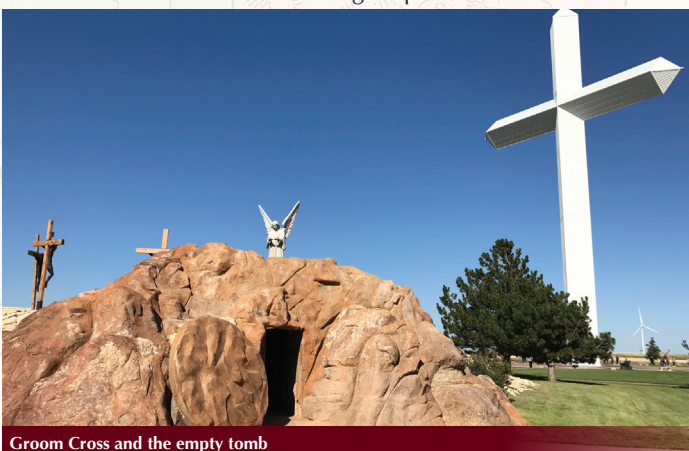
Groom Cross and the empty tomb

Following a hot breakfast at our hotel, we board the motorcoach along with our step-on guide for today's destination, Santa Fe, New Mexico - a magical, exuberant, colorful journey at any time of year. Its legendary history & culture will fascinate and inspire you. The city of Santa Fe was originally occupied by a number of Pueblo Indian villages, with founding dates between 1050 and 1150. One