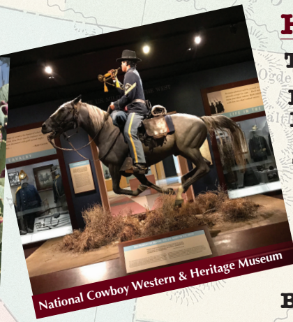
National Cowboy Western & Heritage Museum