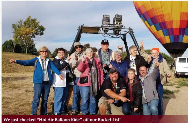
We just checked "Hot Air Balloon Ride" off our Bucket List!