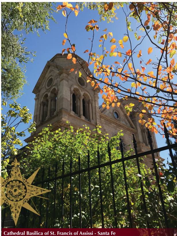
Cathedral Basilica of St. Francis of Assisi - Santa Fe