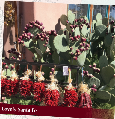
Lovely Santa Fe