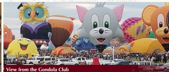
View from the Gondola Club