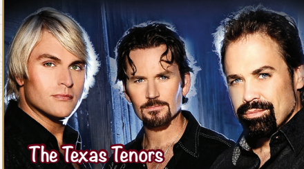
The Texas Tenors