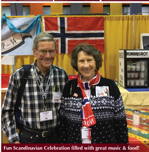
Fun Scandinavian Celebration filled with great music & food!