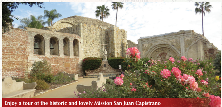
Enjoy a tour of the historic and lovely Mission San Juan Capistrano