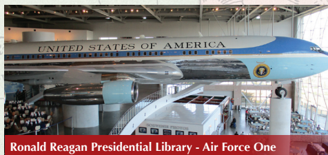
Ronald Reagan Presidential Library - Air Force One