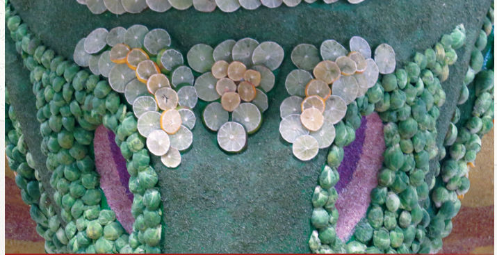
Witness the finishing touches being placed on these incredible floats - lemons & limes!