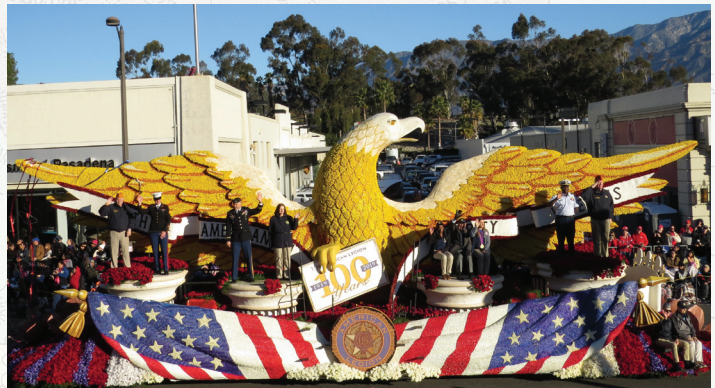
The American Legion Float - The details and colors on each float are remarkable!