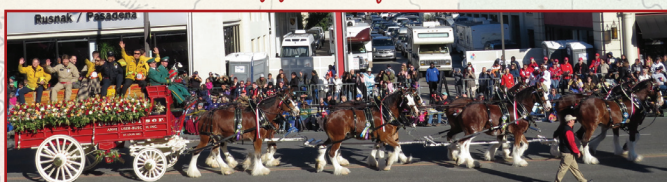
3 Generations exploring LA