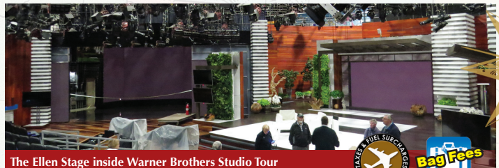
The Ellen Stage inside Warner Brothers Studio Tour