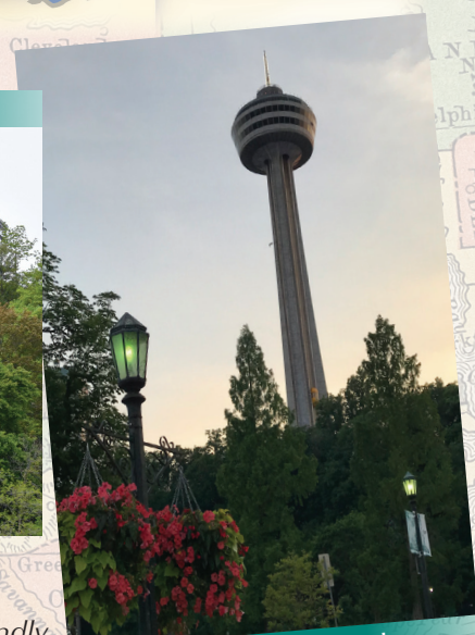
Skylon Tower & flower baskets at dusk

"The Niagara Falls tour with R&J Tours is a great value and trip was even more than we expected . Excellent Tour Director and driver! Both very friendly & knowledgeable."