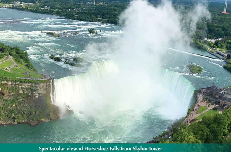
Spectacular view of Horseshoe Falls from Skylon Tower