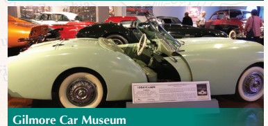
Gilmore Car Museum

Taken from the 1939 poem Niagara by Grenville Mellen