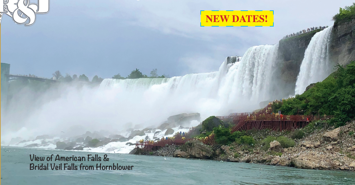
View of American Falls & Bridal Veil Falls from Hornblower