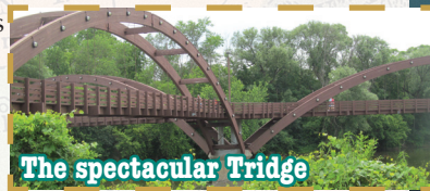
The spectacular Tridge