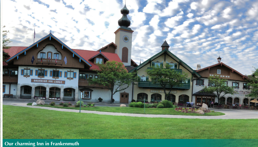
Our charming Inn in Frankenmuth