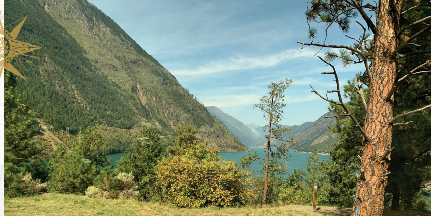
Legendary views on the way to Whistler!