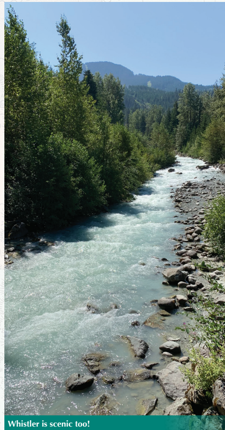
Whistler is scenic too!