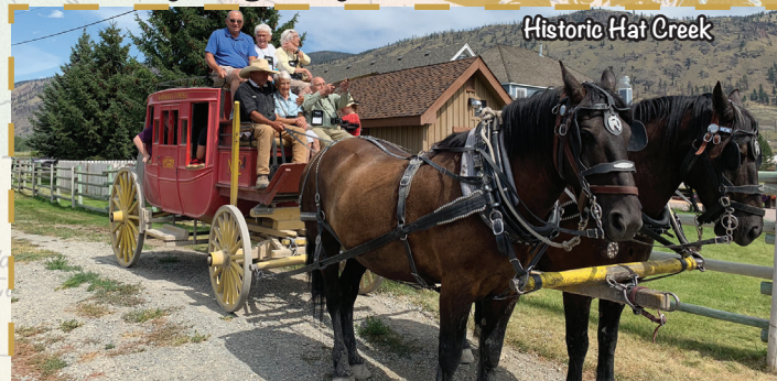
Historic Hat Creek