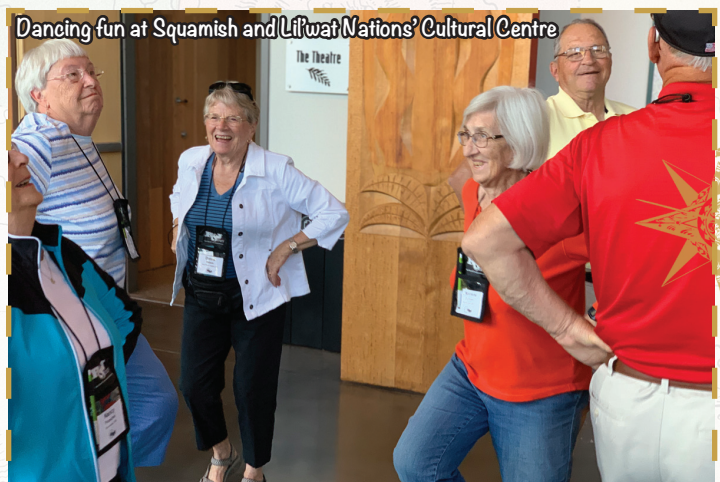
Dancing fun at Squamish and Lil'wat Nations' Cultural Centre