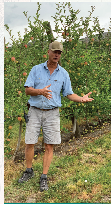
Davison Orchards tour