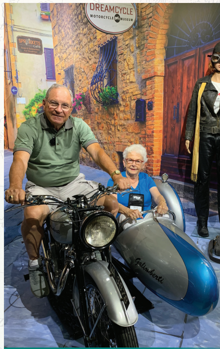
Dreamcycle Motorcycle Museum