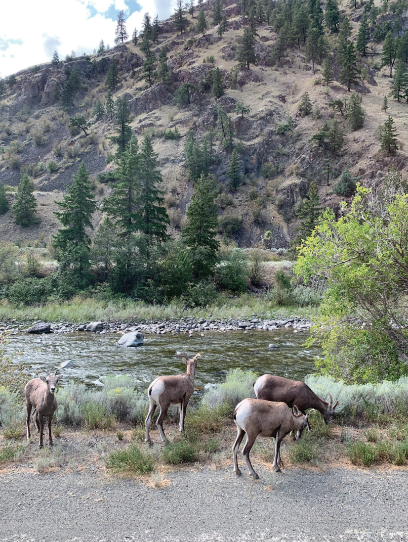
Big horn sheep during our scenic drive from Harrison Hot Springs to Kamloops