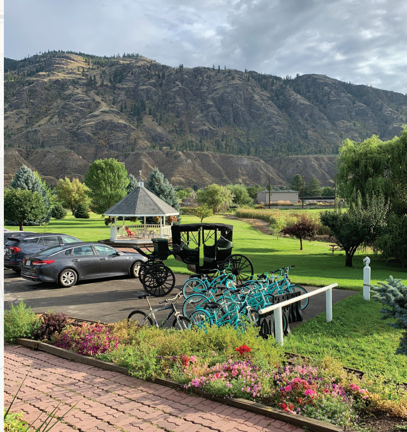
Lovely view from South Thompson Inn - our home for 3 nights!