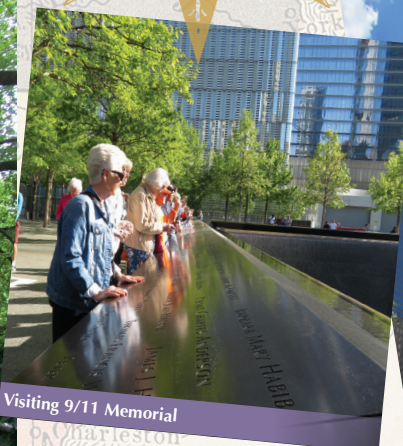
Visiting 9/11 Memorial