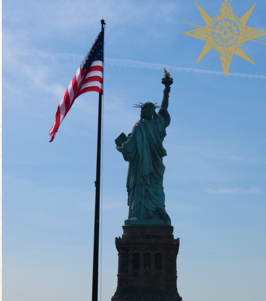
Cruise to Lady Liberty and visit the Statue of Liberty Museum