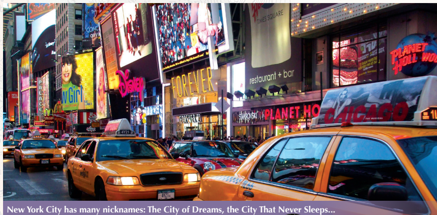
New York City has many nicknames: The City of Dreams, the City That Never Sleeps...