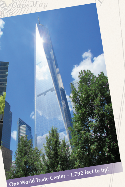
One World Trade Center - 1,792 feet to tip!