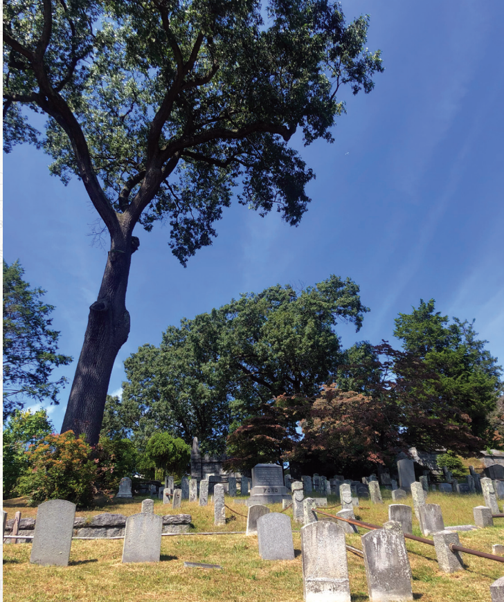
Sleepy Hollow Cemetery - its rich history comes to life with our guide's tales!