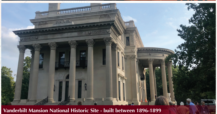
Vanderbilt Mansion National Historic Site - built between 1896-1899