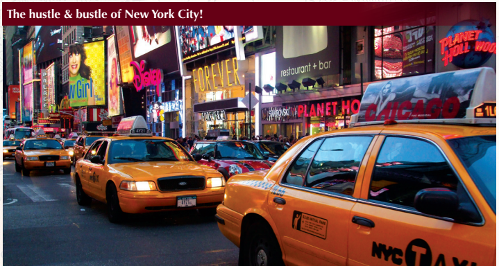
The hustle & bustle of New York City!