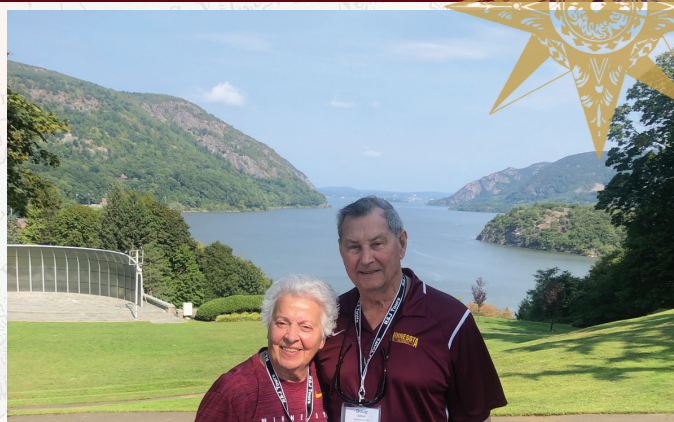
Exploring West Point and taking in it's lovely view of the Hudson River