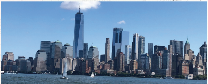
Cruising to the Statue of Liberty & Ellis Island provides great views of NYC's skyline!

This morning we meet our New York City Guide right at our hotel and travel to the southern edge of Manhattan Island and board the shuttle boats that will take us to visit the Statue of Liberty and Ellis Island. Enjoy a walk around Liberty Island and view this magnificent symbol of freedom. On Ellis Island, we'll have an opportunity