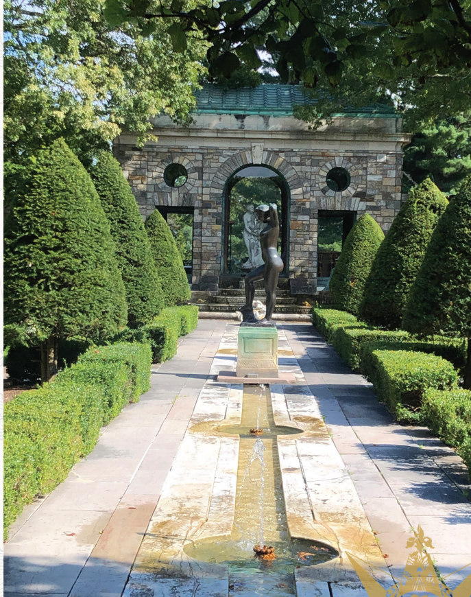
Rockefeller's Kykuit has breathtaking grounds

to view special exhibits that detail the history of the 12 million people who passed through this Island on their way to making America their home. Of course NYC has many more sites to see and our guide will lead us on a special tour of many today. Then we head to the Rockefeller Center and travel up to the Top of the Rock. With sweeping, unobstructed views of both Central Park and Manhattan's midtown & downtown skyscrapers, the view from Top of the Rock is truly one of a kind! If there is any place else in NYC you wish to explore, tonight's the night!