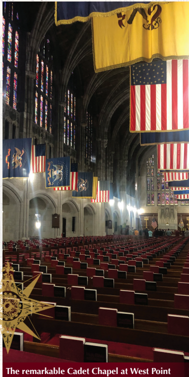
The remarkable Cadet Chapel at West Point

and hosts the world's largest chapel pipe organ! We'll have time to enjoy the West Point Museum following our tour and of course a stop in the West Point Gift Shop. Then we board the Pride of the Hudson for a narrated luncheon cruise. Our captain will enlighten us about the passing sights, like Washington's Headquarters, Mount Beacon, Bannerman Island, and more! The remainder of the afternoon and evening are at leisure.