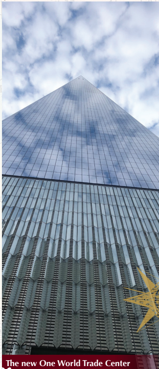
The new One World Trade Center

Today we travel to the West Point Military Academy. What a great opportunity for the R&J Travelers this will be! A step-on guide will board our coach and we will learn the story of West Point, its role in the Revolution, its famous history, as well as stories about graduates who shaped our nation. The majestic Cadet Chapel, completed in 1910, is a classic example of gothic revival architecture,