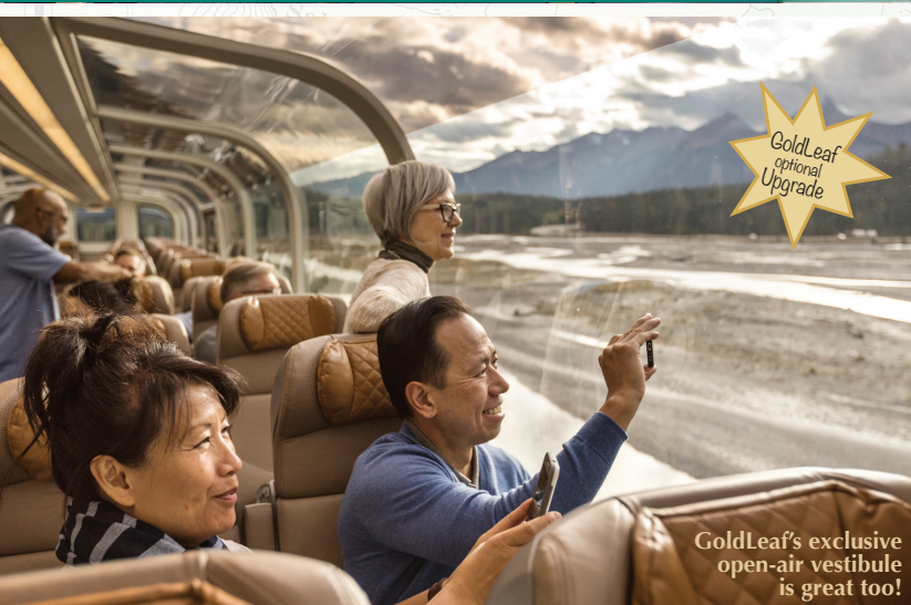
Tour includes SilverLeaf Coach Class with its oversized glass dome windows