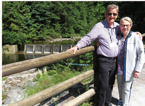
Capilano Salmon Hatchery - Vancouver