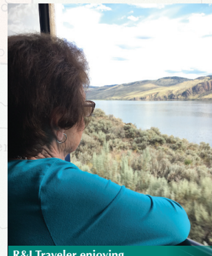
R&J Traveler enjoying outdoor viewing area