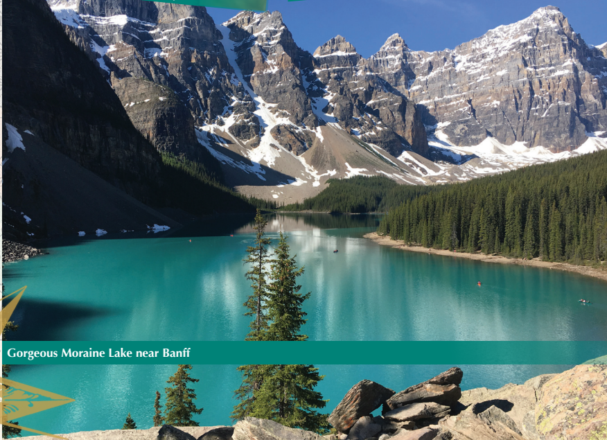
Gorgeous Moraine Lake near Banff