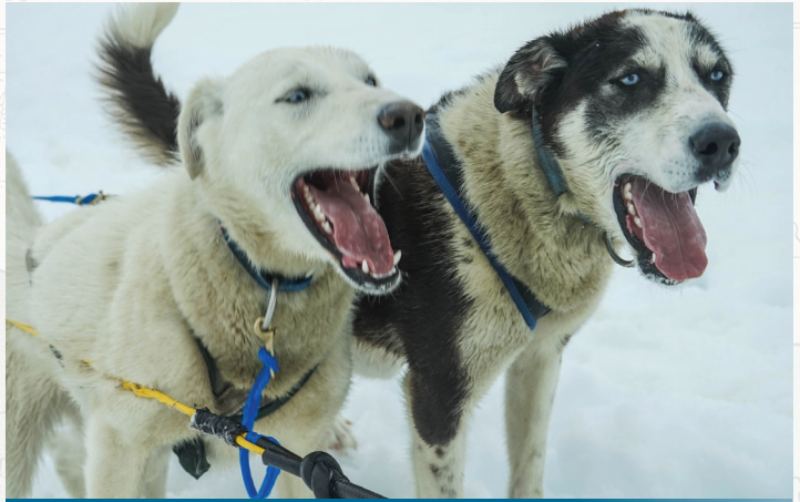
The Sled Dogs can't wait to get the race started!

Denali National Park is breathtaking in the winter - truly a winter wonderland!