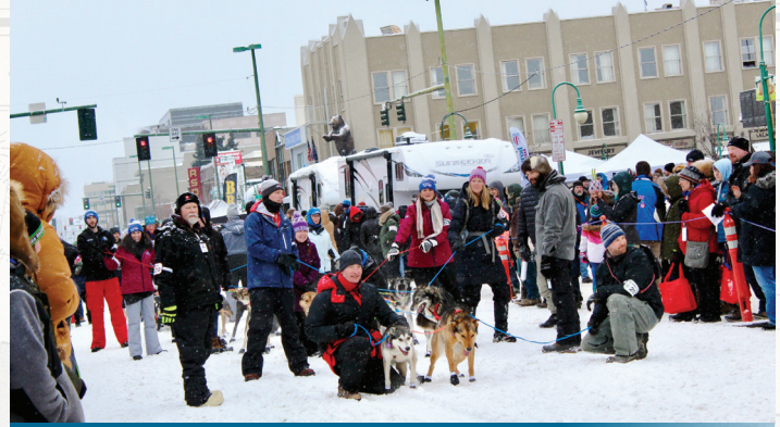
Dog handlers get mushing teams ready as they enter the start chute - Anchorage