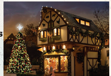
Christmas Village is spectacular!