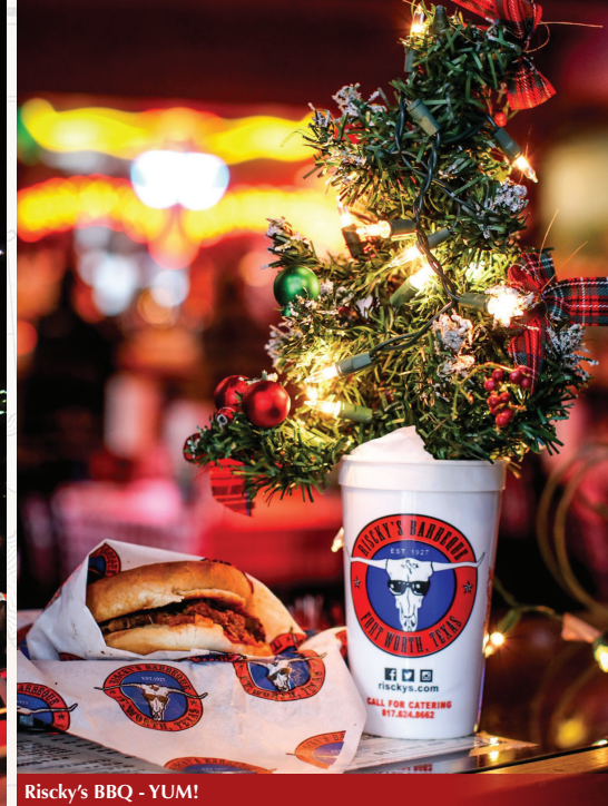
Risky's BBQ - YUM!

festive settings of their beautiful DeGolyer Tea Room! This evening delicious dinner is served at Tolbert's before we enjoy a traditional holiday movie at the Historic Palace Theatre, built in 1940.