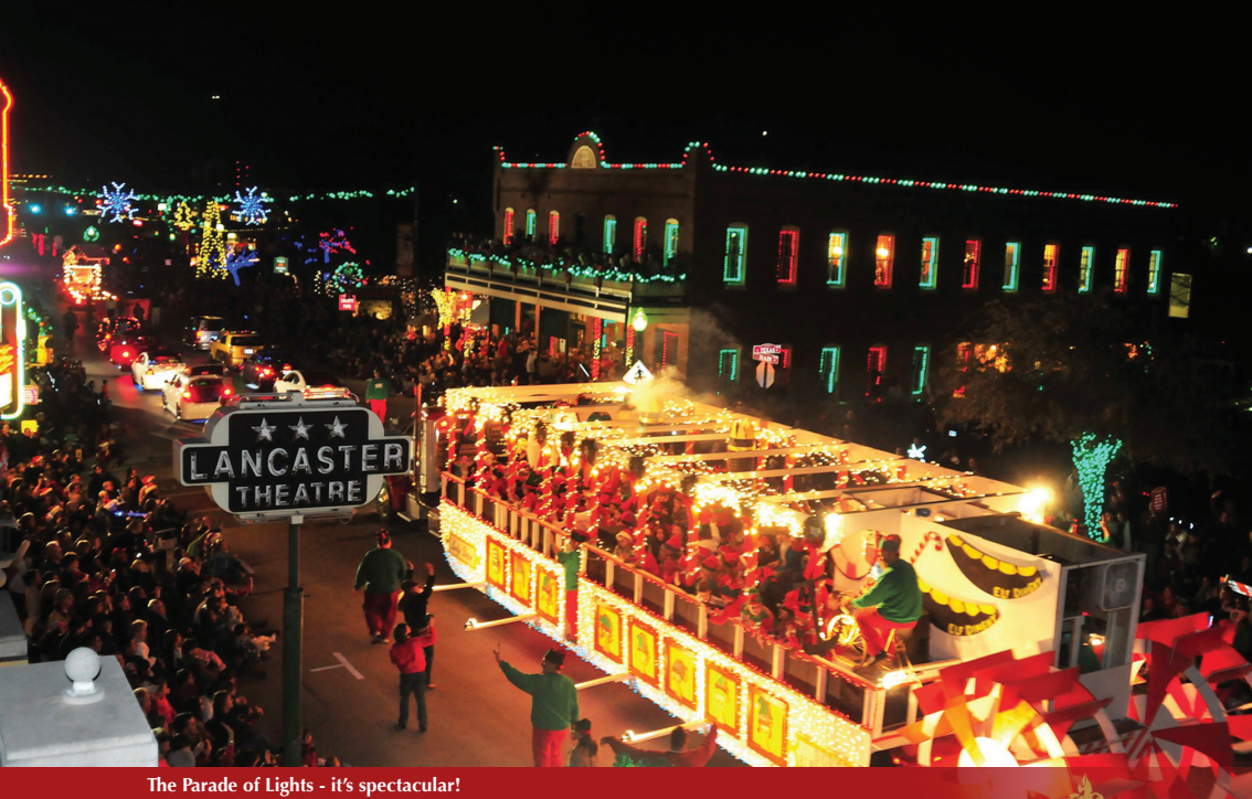
The Parade of Lights - it's spectacular!