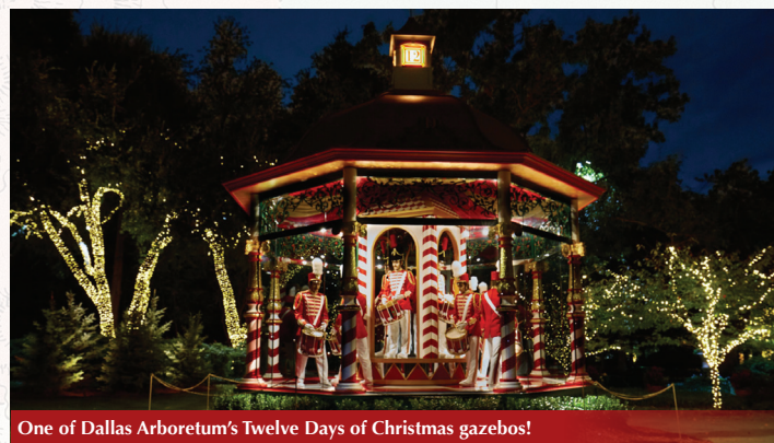
One of Dallas Arboretum's Twelve Days of Christmas gazebos!