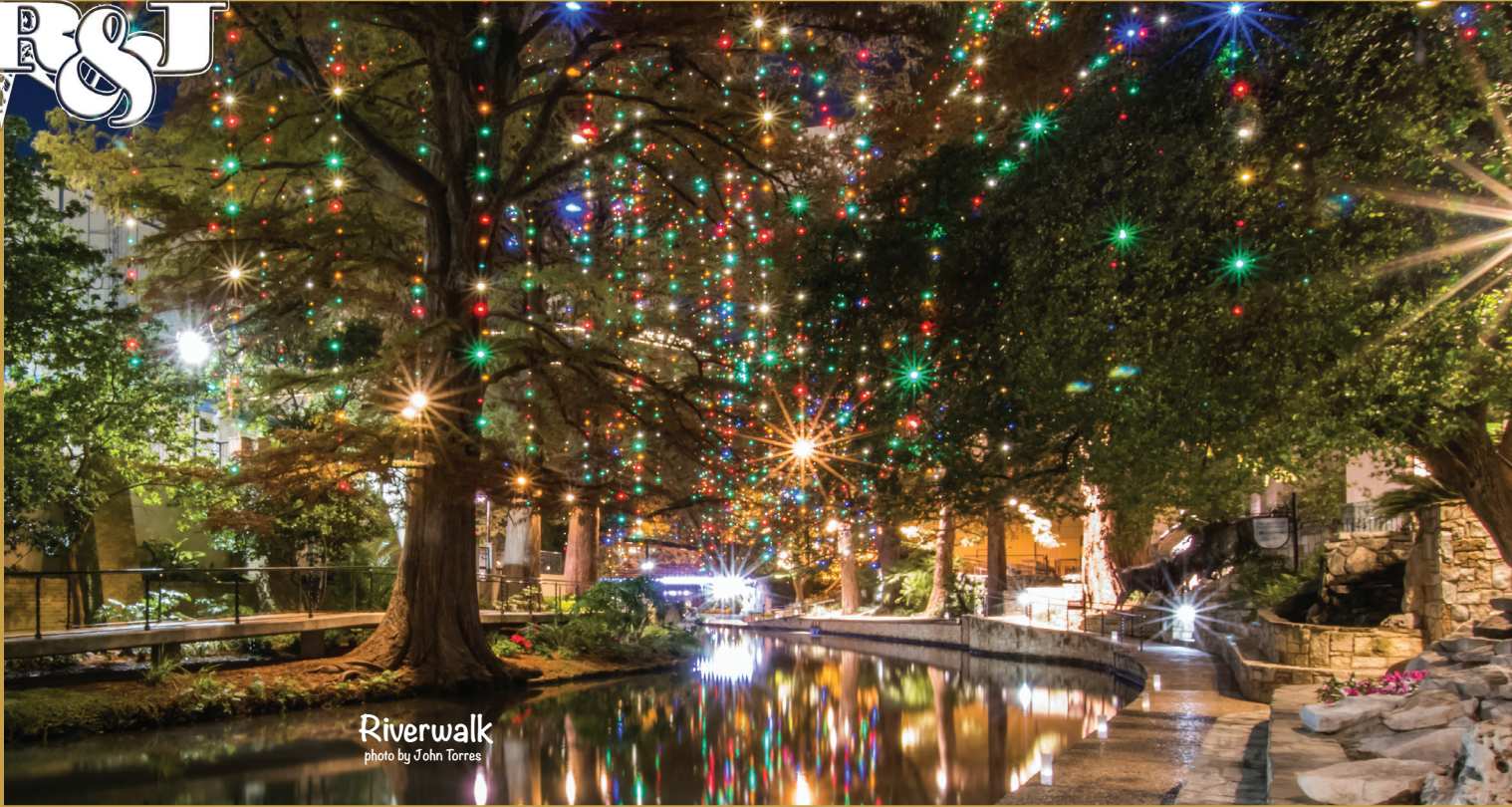
Riverwalk