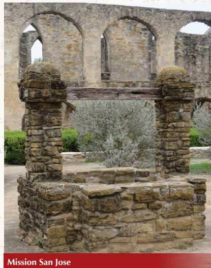
Mission San Jose