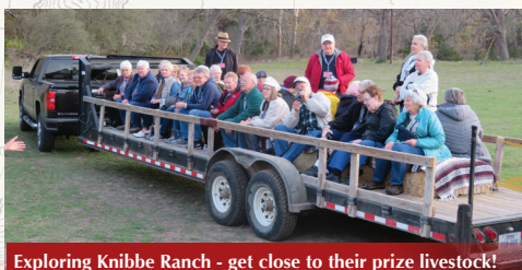
Exploring Knibbe Ranch - get close to their prize livestock!