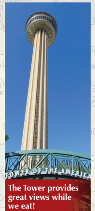
The Tower provides great views while we eat!