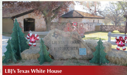
LBJ's Texas White House