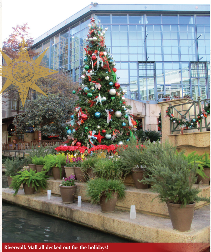
Riverwalk Mall all decked out for the holidays!