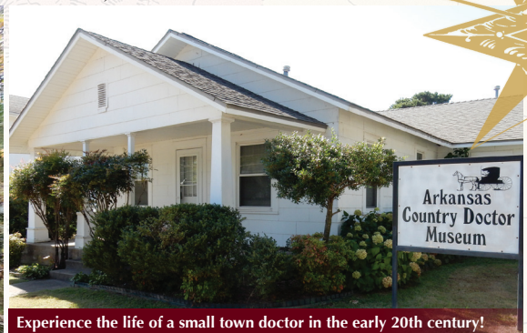
Experience the life of a small town doctor in the early 20th century!