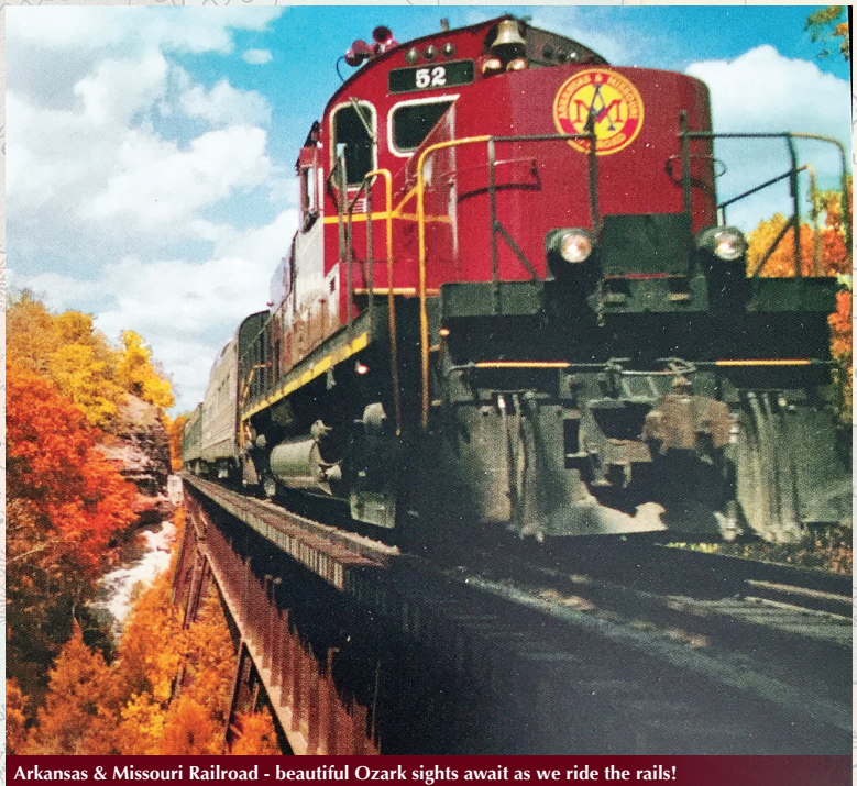
Arkansas & Missouri Railroad - beautiful Ozark sights await as we ride the rails!