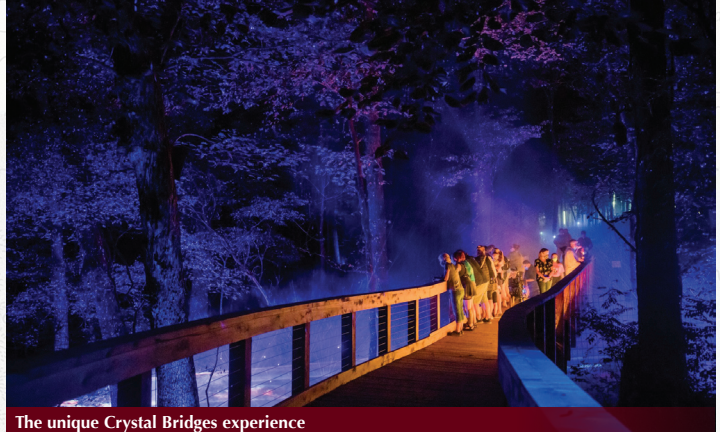
The unique Crystal Bridges experience