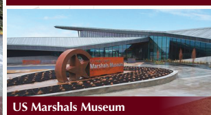
US Marshals Museum