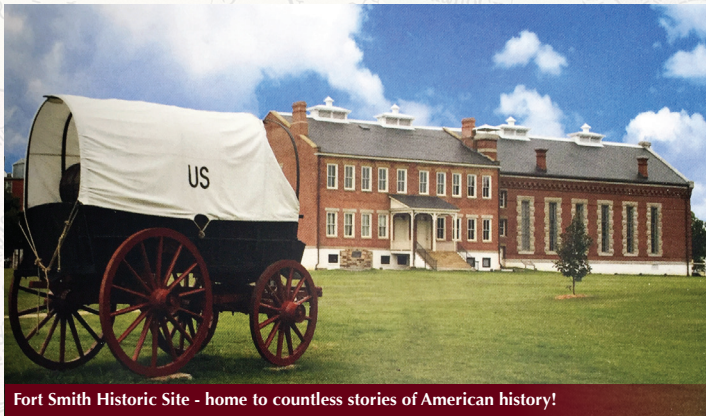
Fort Smith Historic Site - home to countless stories of American history!

nel. Marvel at the fall colors now at their peak in the scenic foothills of the Boston Mountains of the Ozarks. Since we got up so early we are ready for lunch. So "let's do lunch" in true Arkansas style. That would be at Calico County. This is Home Cookin' Good, made from scratch recipes, served in an atmosphere full of American Memories! Fort Smith is a colorful, festive, and historic frontier border town. Art is important here, as witnessed by over 25 brilliant murals placed throughout the city. We are pleased to observe a number of these, aided by the interpretation of a local guide on our way to the US Marshals Museum. Today we are privileged to be welcomed by the CEO who will introduce us to this amazing new facility. The just completed US Marshals Museum was created to honor the 230 year history of the Marshals Service, telling the deep and rich story of America's Constitution and the Rule of Law. Our group is honored to be one of the very first invited to visit. Fort Smith National Historic Site is just down the road. Explore life on the edge of the Frontier through the stories of soldiers, the Trail of Tears, scandals, outlaws and the lawmen who pursued them. Our own motorcoach will transport us back to our hotel. Dinner and the evening are on your own to relax, reflecting on the experiences of the day.