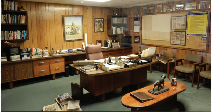
Sam Walton's Office