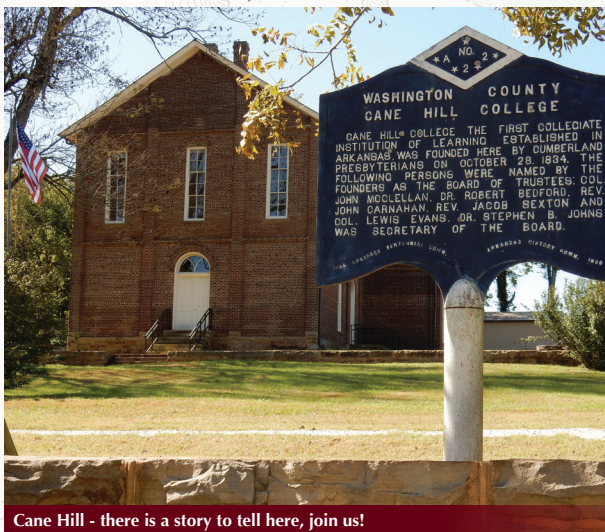
Cane Hill - there is a story to tell here, join us!