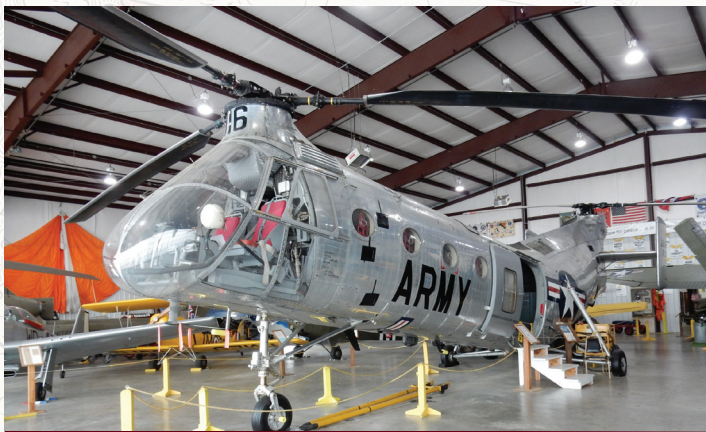
Arkansas Air & Military Museum - most of the aircraft we'll see still fly!