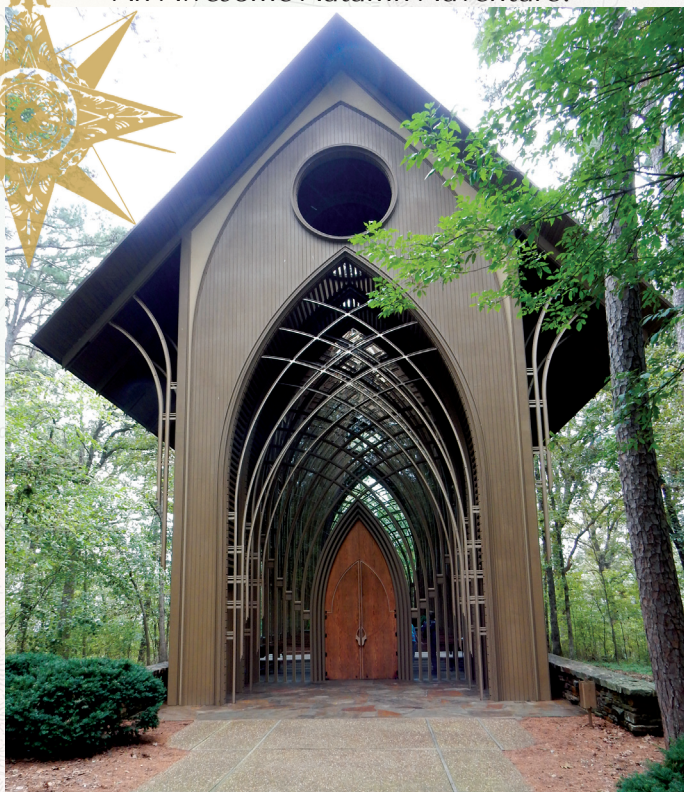
Mildred B. Cooper Memorial Chapel - in a wooden hilltop overlooking Lake Norwood