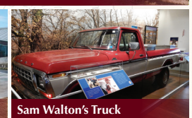
Sam Walton's Truck