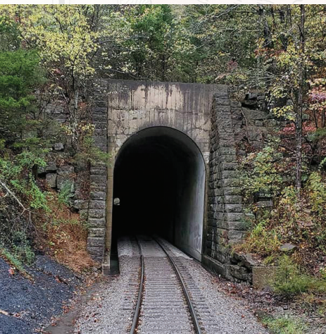
Will our train fit through this tunnel?!