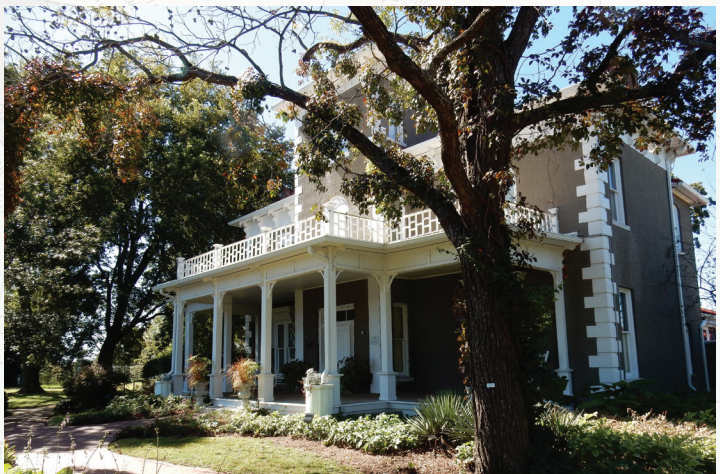
Peel Mansion - this extraordinary Italianate mansion was built in 1875