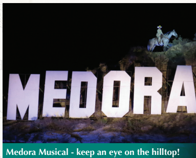
Medora Musical - keep an eye on the hilltop!