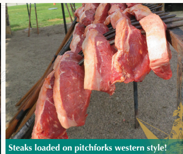
Steaks loaded on pitchforks western style!