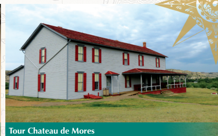
Tour Chateau de Mores

ing the ranch's 66th annual Champions Ride Saddle Bronc Rodeo. An exclusive orientation tour of the ranch, lunch in the Home on the Range kitchen, and special reserved seating for the rodeo has all been arranged for our group. This will truly be an unequalled experience you will want to share with family and friends when you return. We return to Medora this afternoon to just relax before we have dinner on the Schaefer Center Patio.