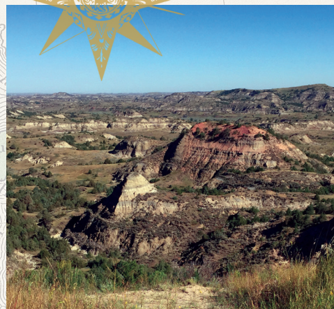
Theodore Roosevelt National Park