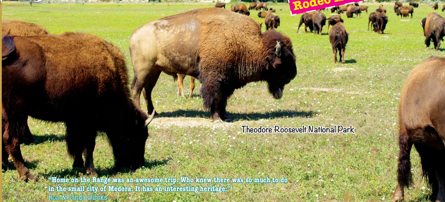
Theodore Roosevelt National Park