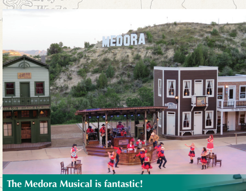
The Medora Musical is fantastic!