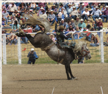
Champions Rodeo - enjoy reserved seats!