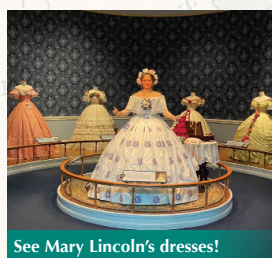
See Mary Lincoln's dresses!