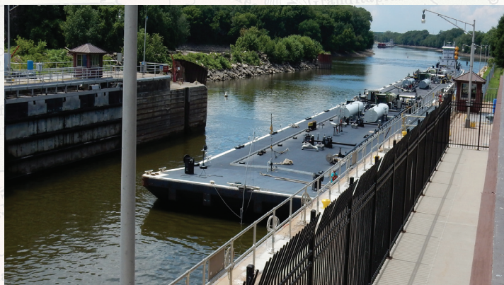
Like this barge, we will traverse through Lock & Dam 25!