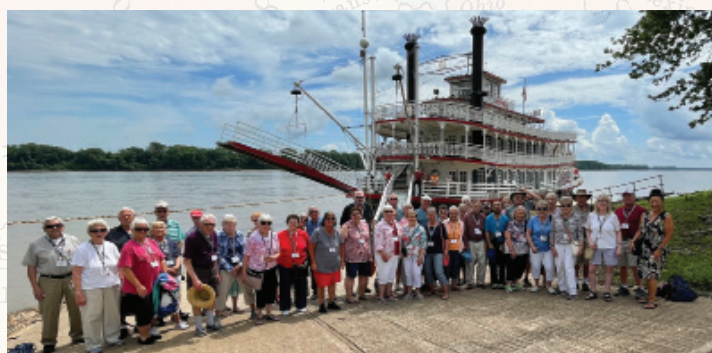
2021 R&J Group