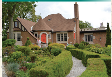
Starved Rock State Park - Weber House built in 1938