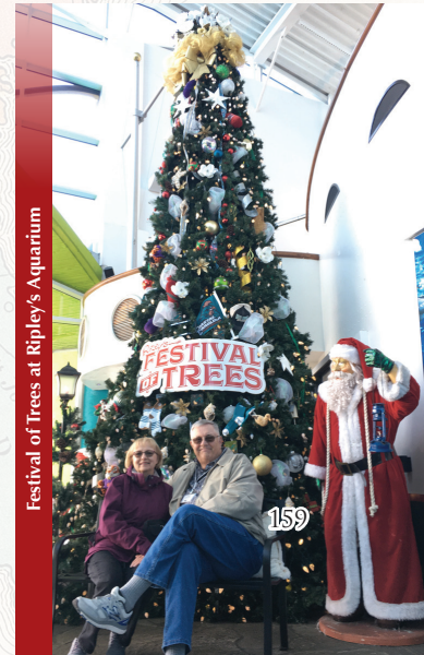
Festival of Trees at Ripley's Aquarium