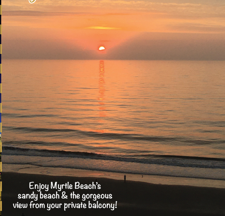
Enjoy Myrtle Beach's sandy beach & the gorgeous view from your private balcony!