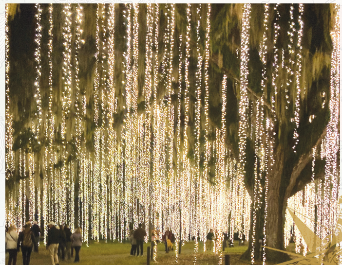
Brookgreen Gardens becomes magical as the sun sets!