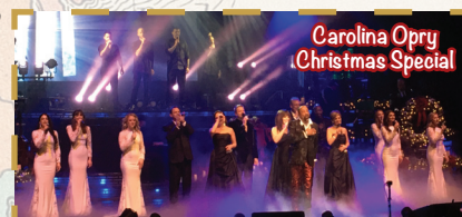
Carolina Opry Christmas Special