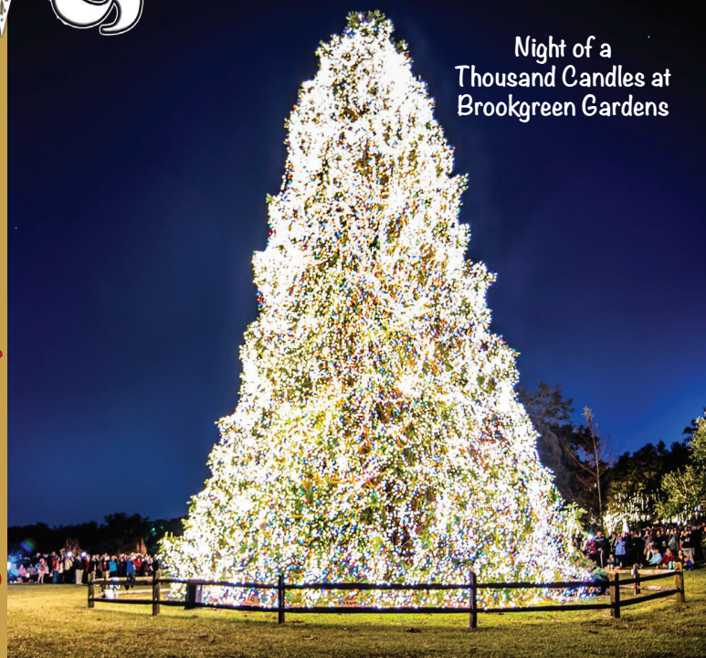
Night of a Thousand Candles at Brookgreen Gardens