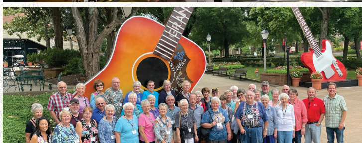
2021 R&J Group exploring Nashville