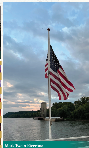
Mark Twain Riverboat