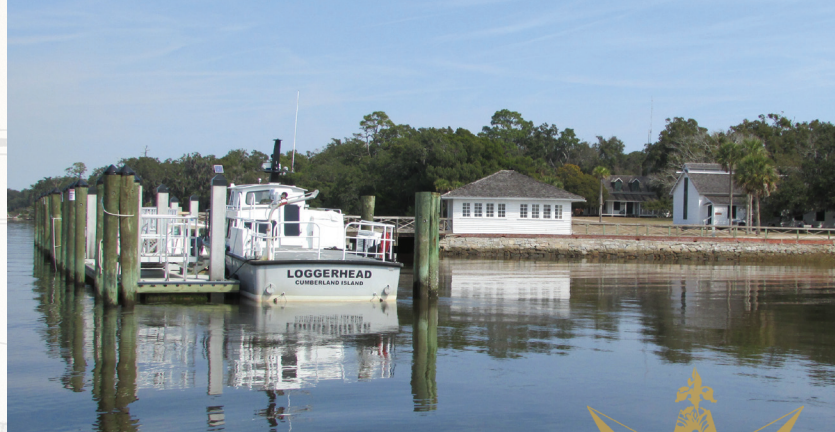
Amelia Island River Cruise - taking in the sights on Cumberland Island