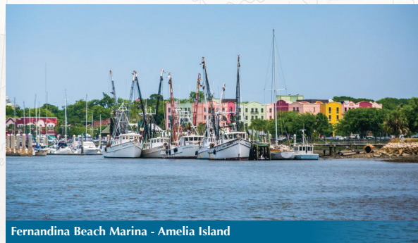
Fernandina Beach Marina - Amelia Island