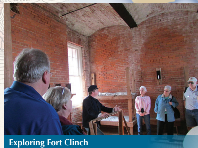
Exploring Fort Clinch