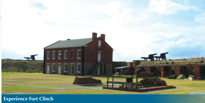
Experience Fort Clinch

Hotel: Hampton Inn & Suites Vilano Beach (4 Nights)