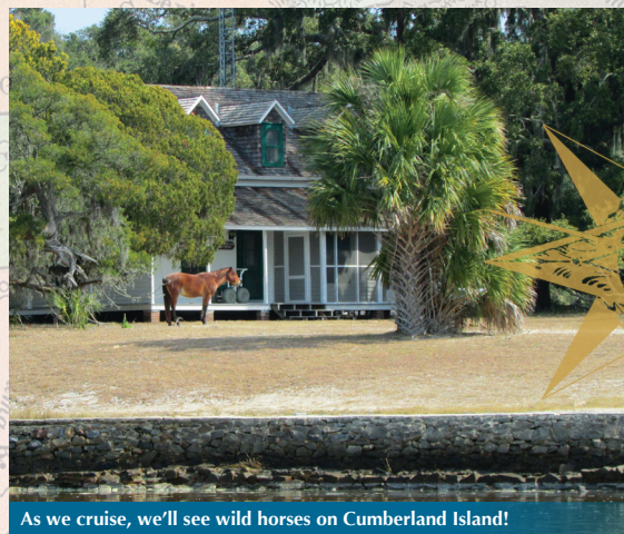
As we cruise, we'll see wild horses on Cumberland Island!